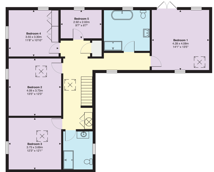
First Floor Area: 103.8 m 2 ... 1118 ft 2