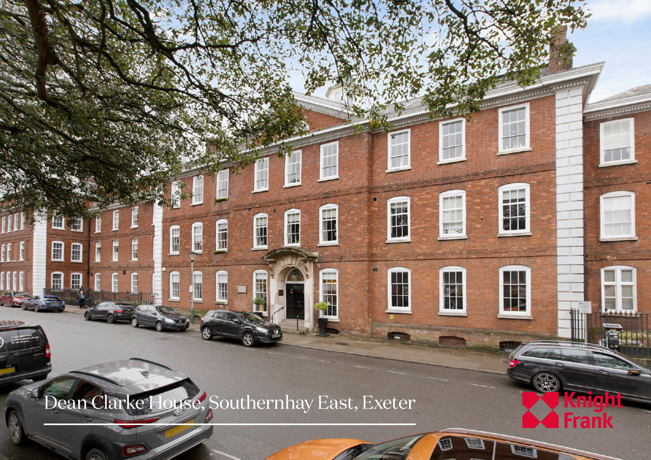
Dean Clarke House, Southernhay East, Exeter