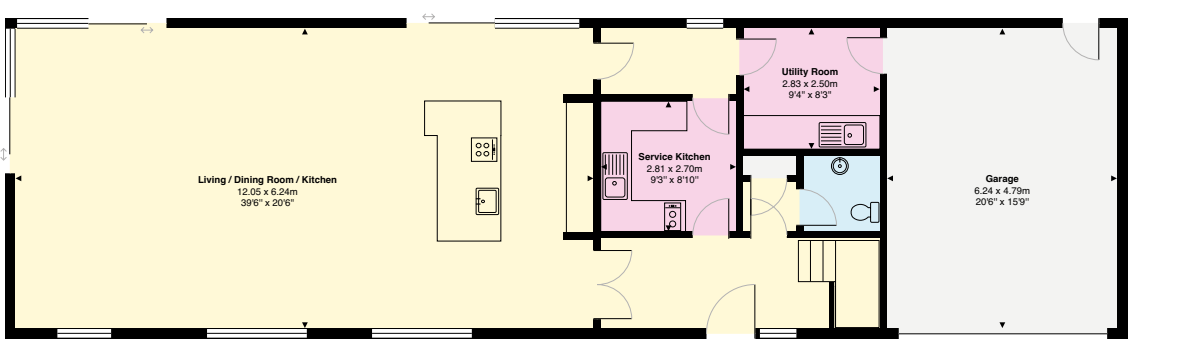
Ground Floor Area: 143.3 m<sup>2</sup> ... 1542 ft<sup>2</sup>