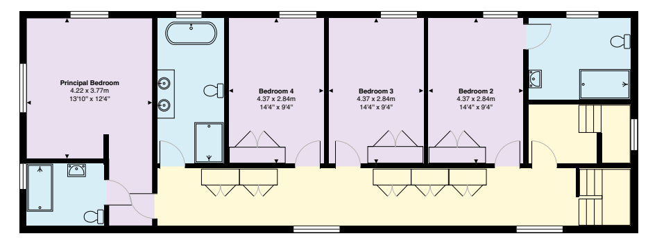
First Floor Area: 113.2 m² ... 1218 ft²