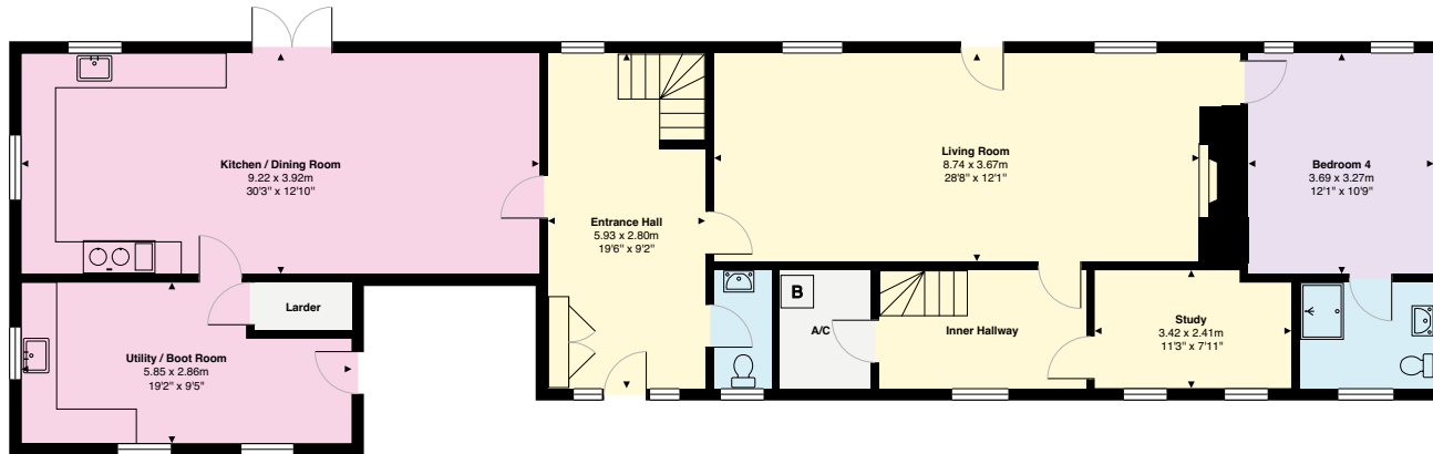
Ground Floor Area: 148.4 m 2 ... 1597 ft 2