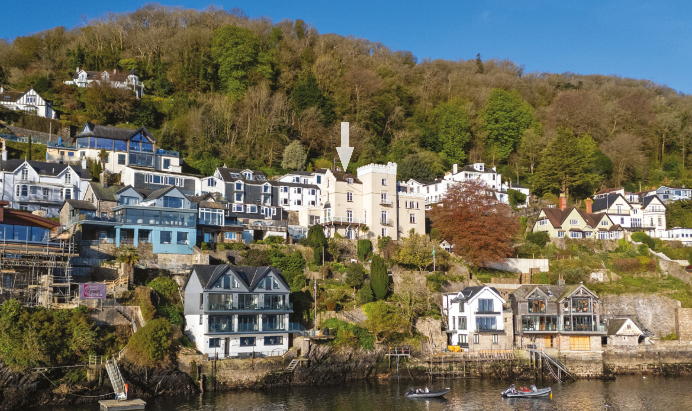
Lower Gramercy Tower, Warfleet, Dartmouth