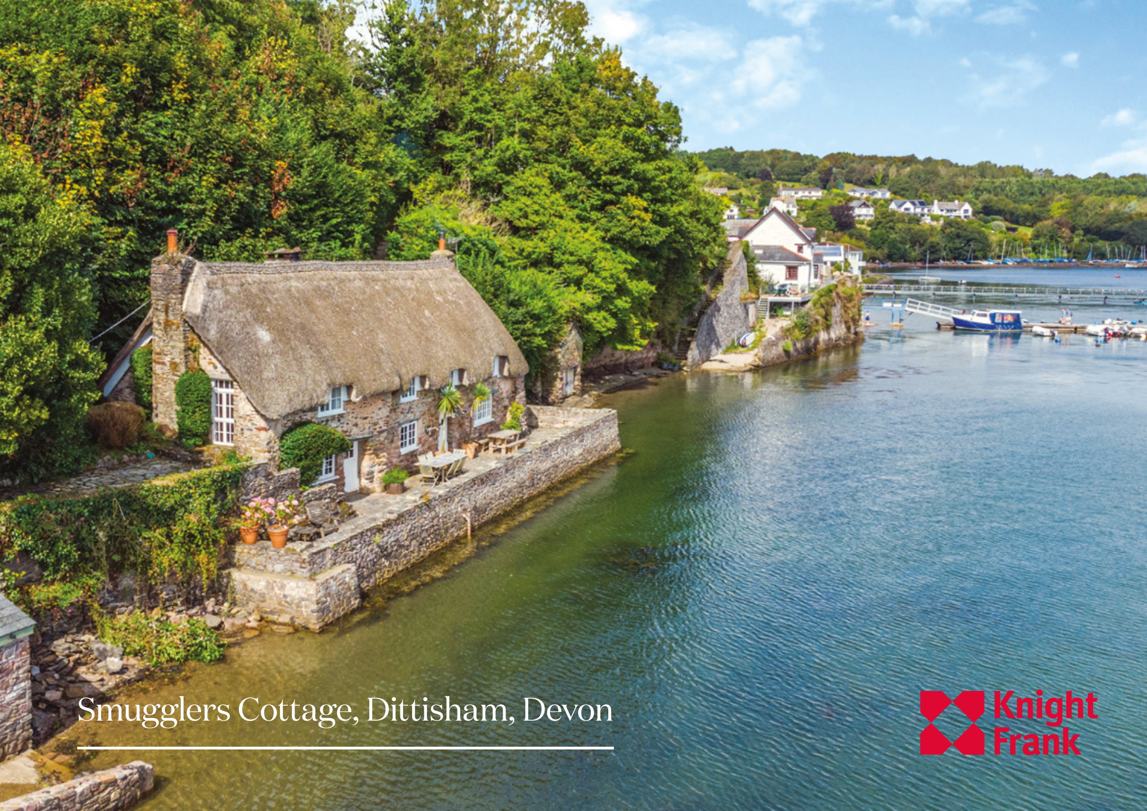
Smugglers Cottage, Dittisham, Devon