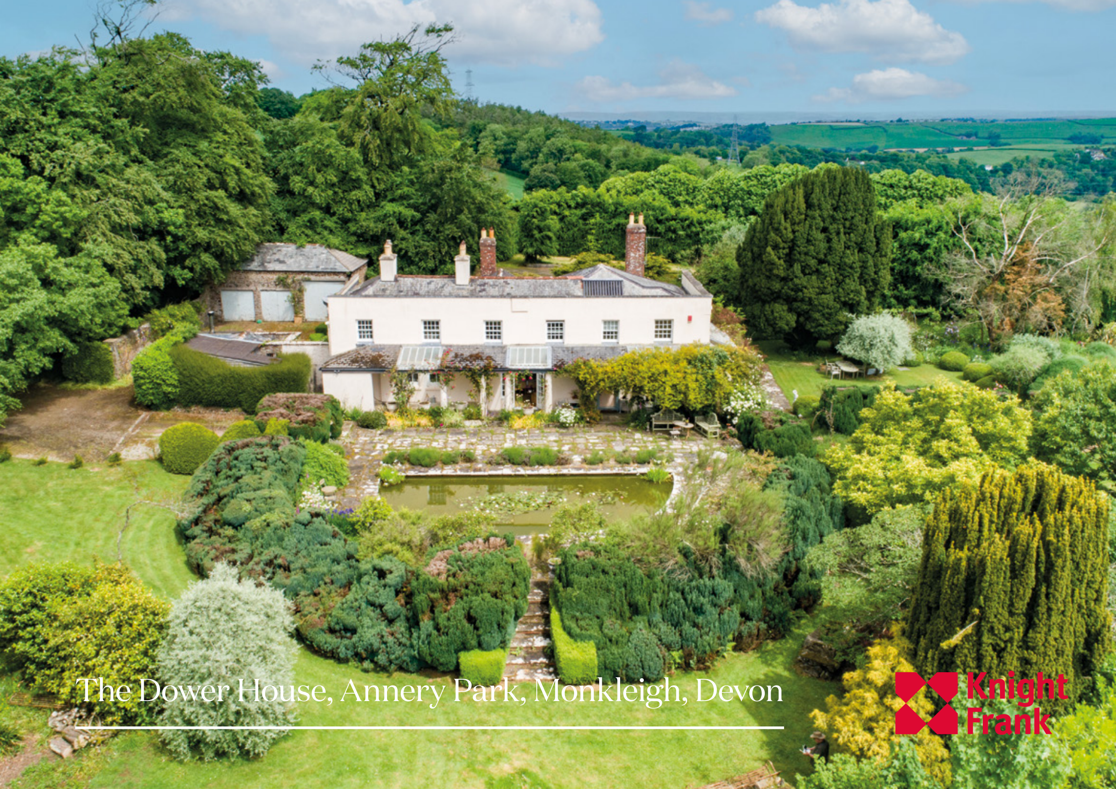
The Dower House, Annery Park, Monkleigh, Devon