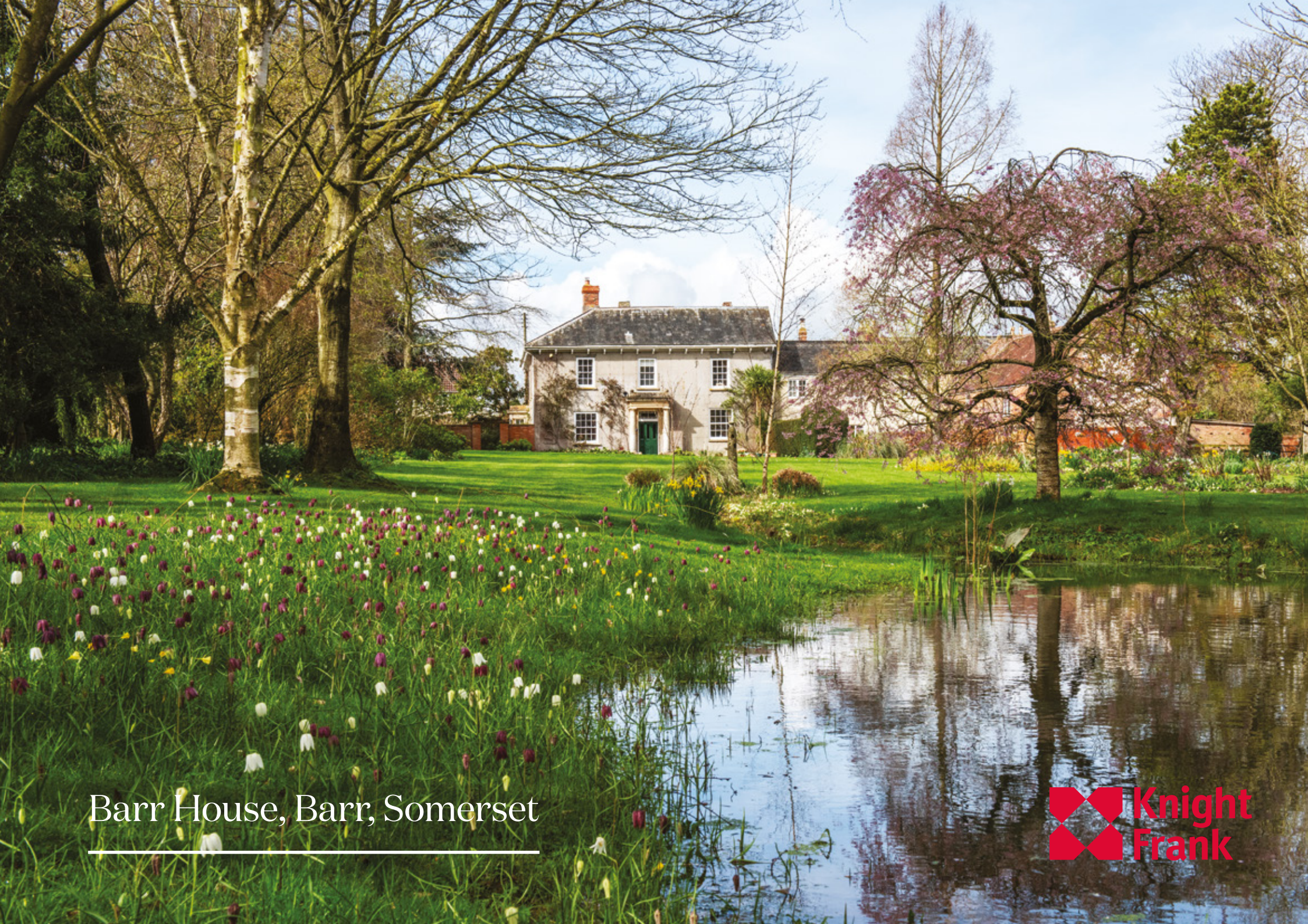
Barr House, Barr, Somerset