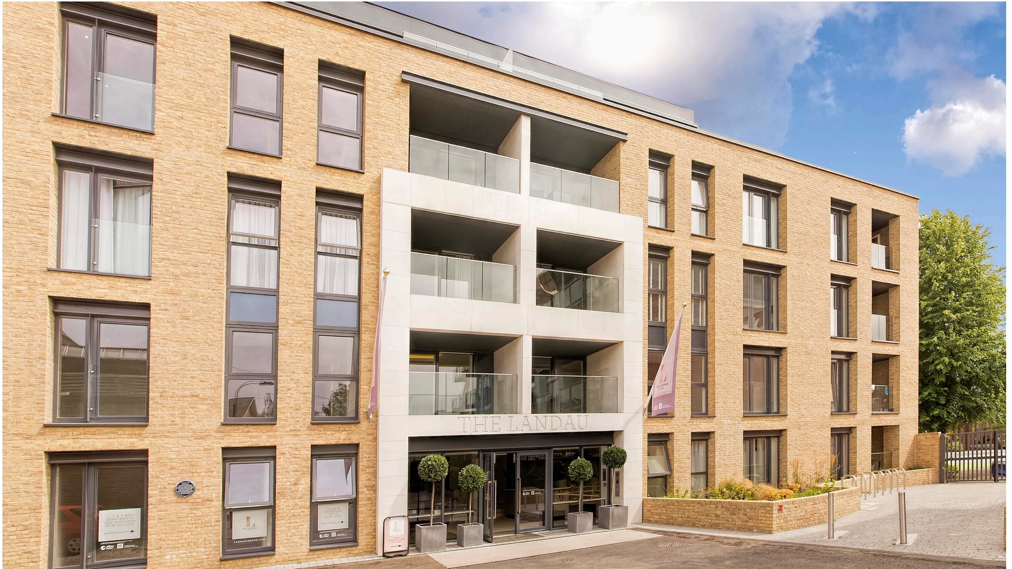
Landau Apartments, Fulham, London SW6