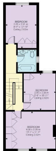
First Floor 532 ft 2