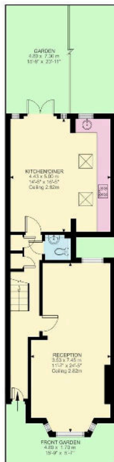
Ground Floor 655 ft 2