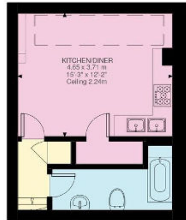
Lower Ground Floor 296 ft 2

This plan is for guidance only and must not be relied upon as a statement of fact. Attention is drawn to the important notice on the last page of the text of the Particulars.