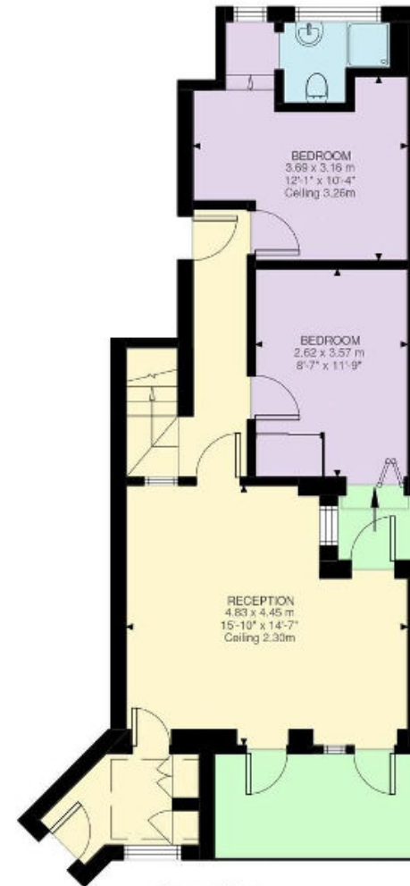
Ground Floor 581 ft 2