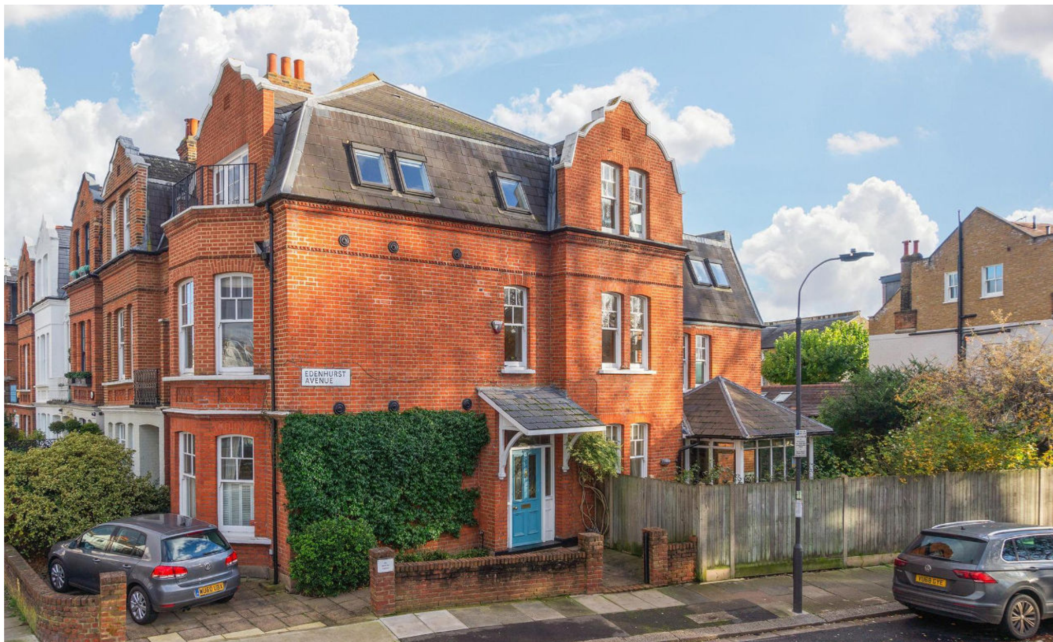
Edenhurst Avenue, Fulham SW6