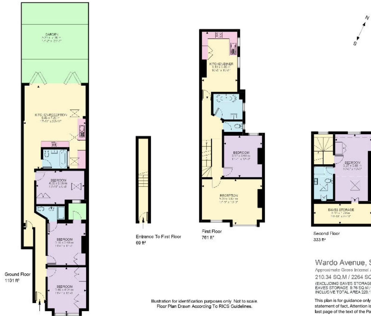
Illustration for identification purposes only. Not to scale. Floor Plan Drawn According To RICS Guidelines.

Knight Frank Fulham 203 New Kings Road Fulham SW6 4SR knightfrank.co.uk