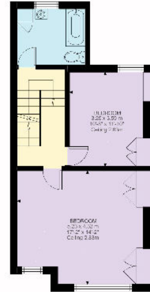
First Floor 512 ft 2