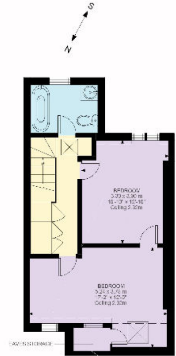
Second Floor 485 ft 2