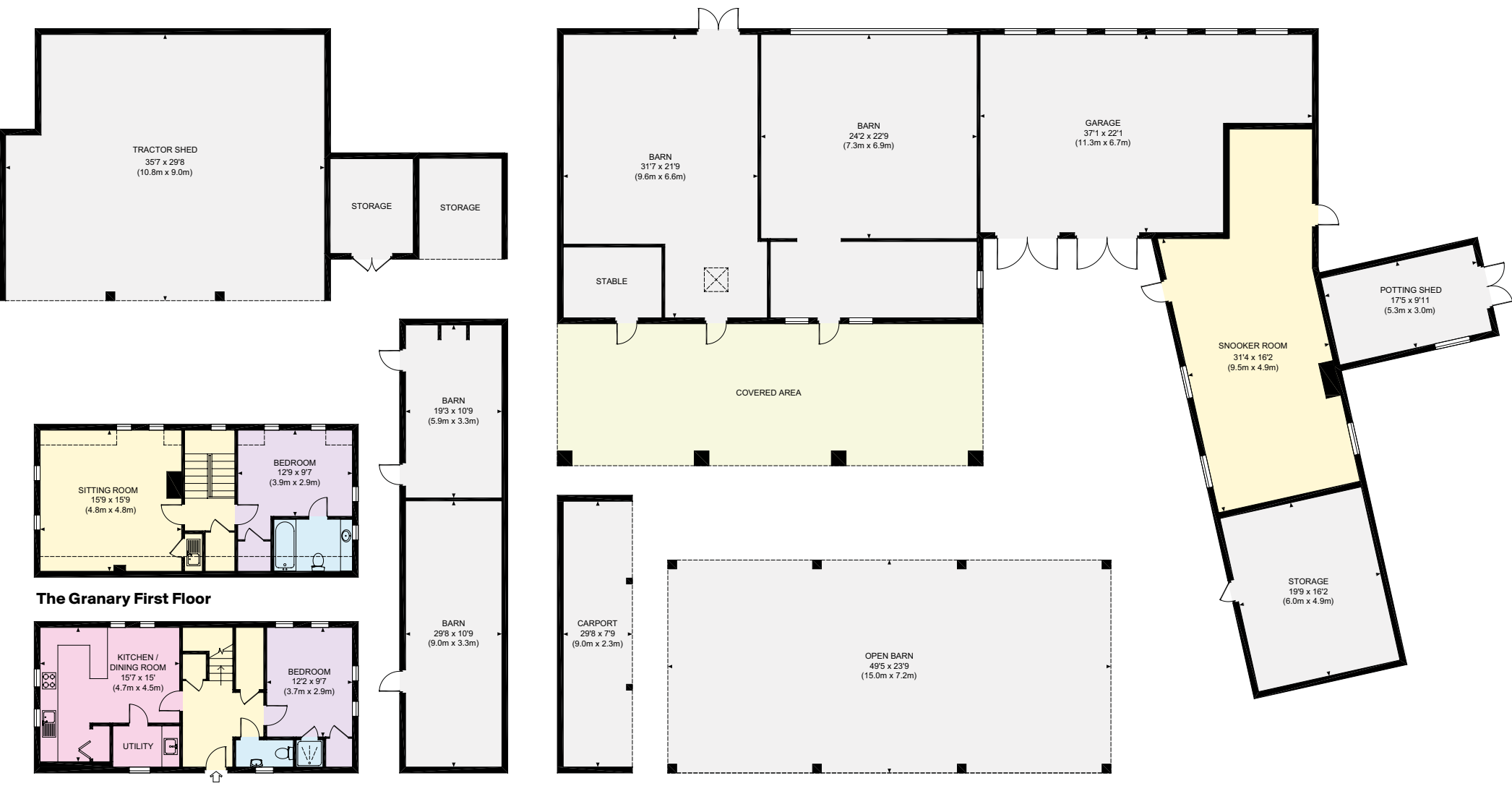
The Granary Ground Floor

This plan is for guidance only and must not be relied upon as a statement of fact. Attention is drawn to the Important Notice on the last page of the text of the Particulars