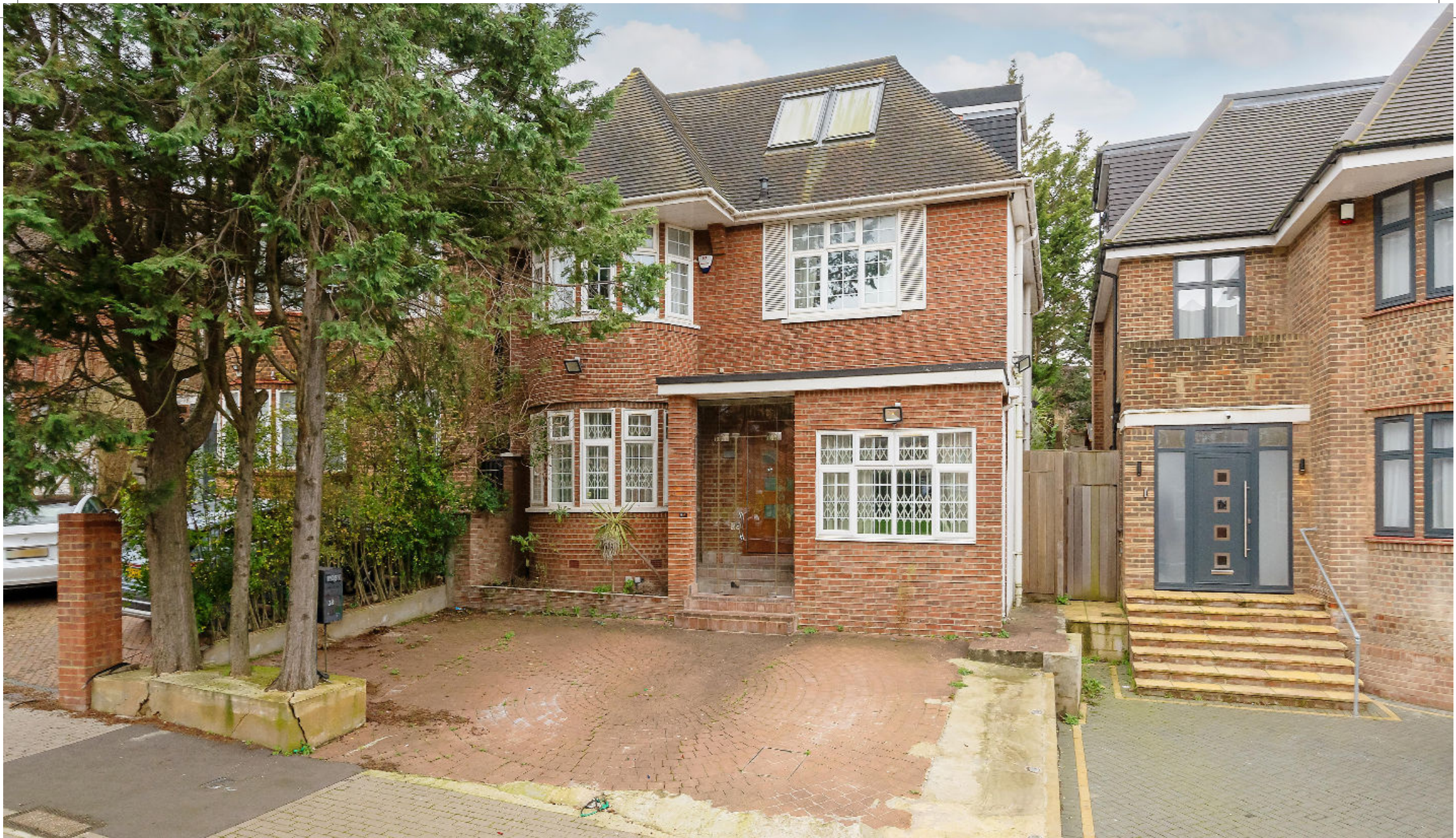
Beaufort Drive, London NW11