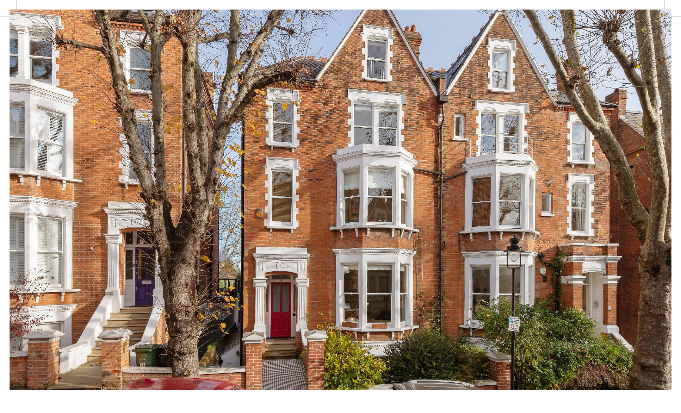
Tanza Road, Hampstead, London NW3