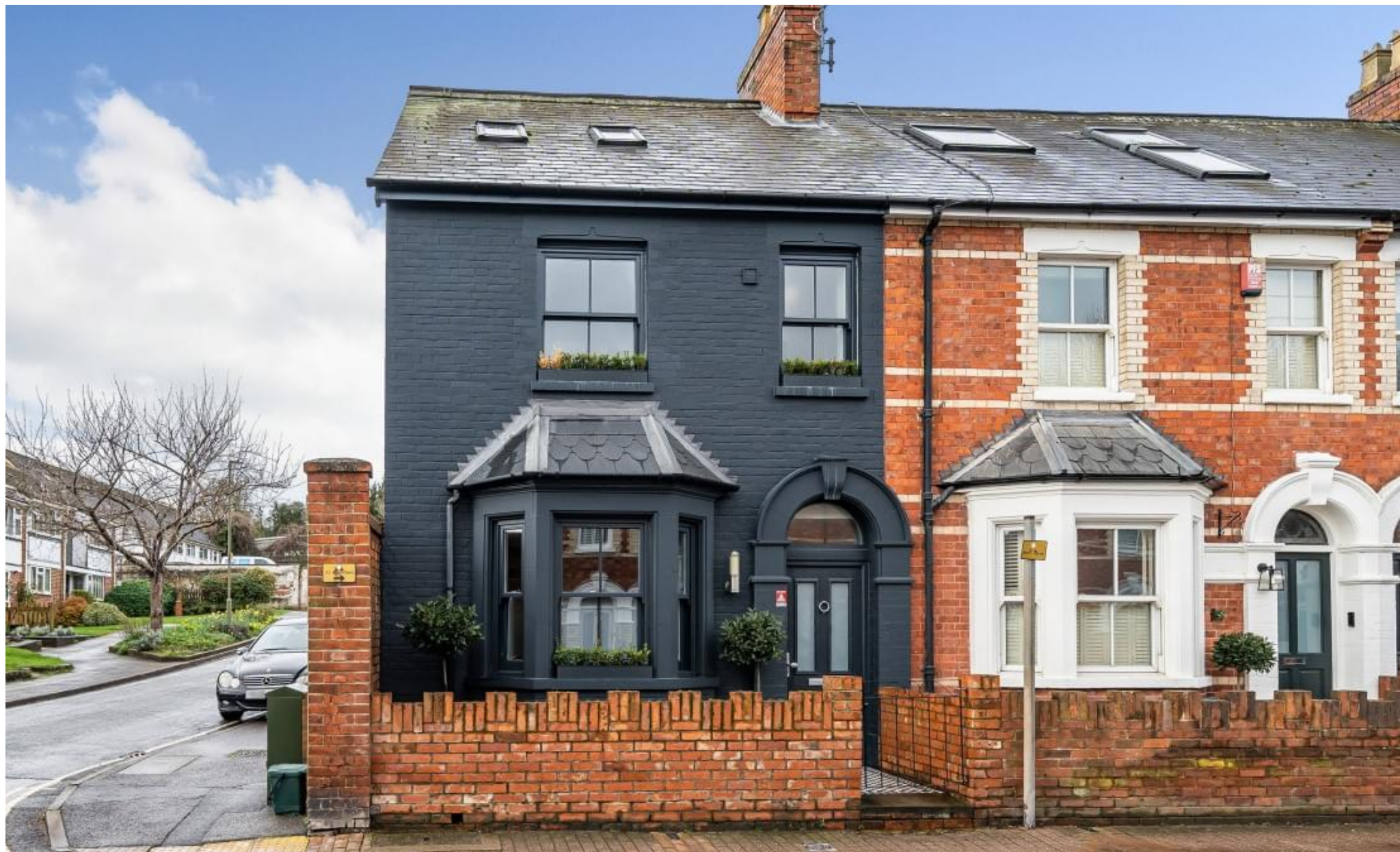
Kings Road, Henley-on-Thames, Oxfordshire