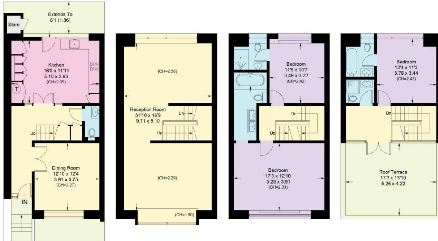
Ground Floor Approximate Area = 50.2 sq m / 540 sq ft Including Limited Use Area (0.8 sq m / 8 sq ft)