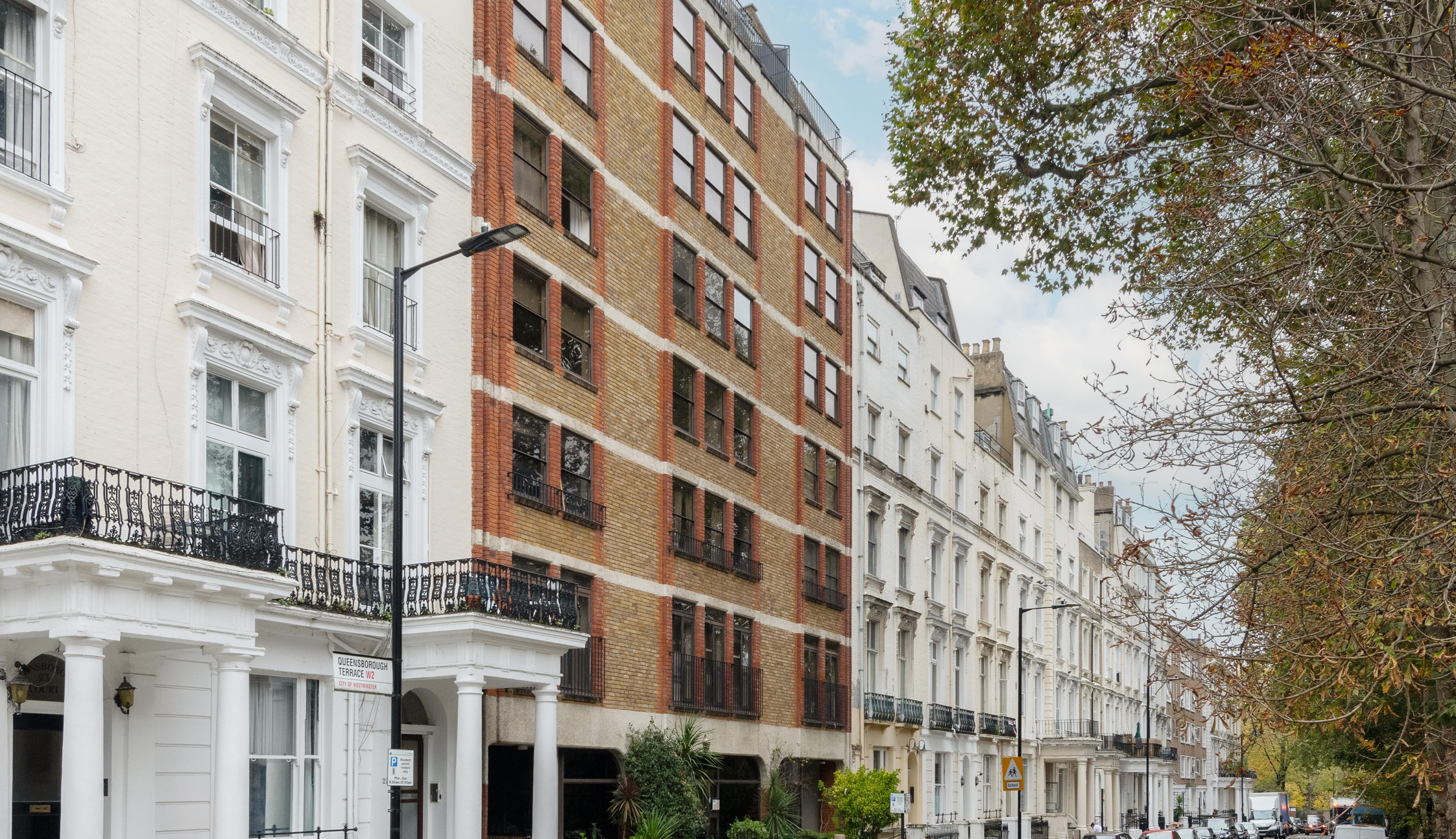
Queensborough Terrace, Hyde Park W2