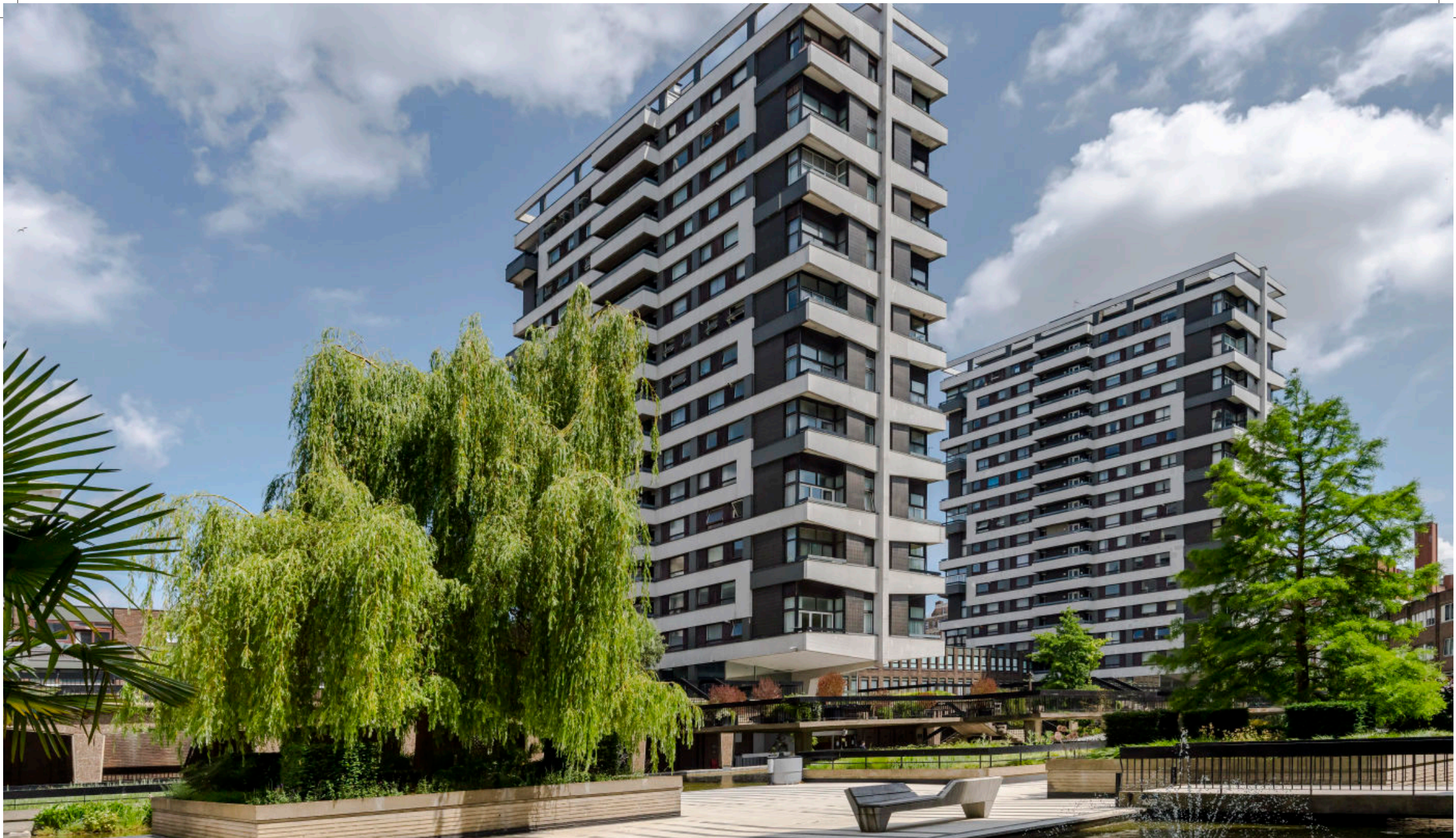
The Water Gardens, Hyde Park W2