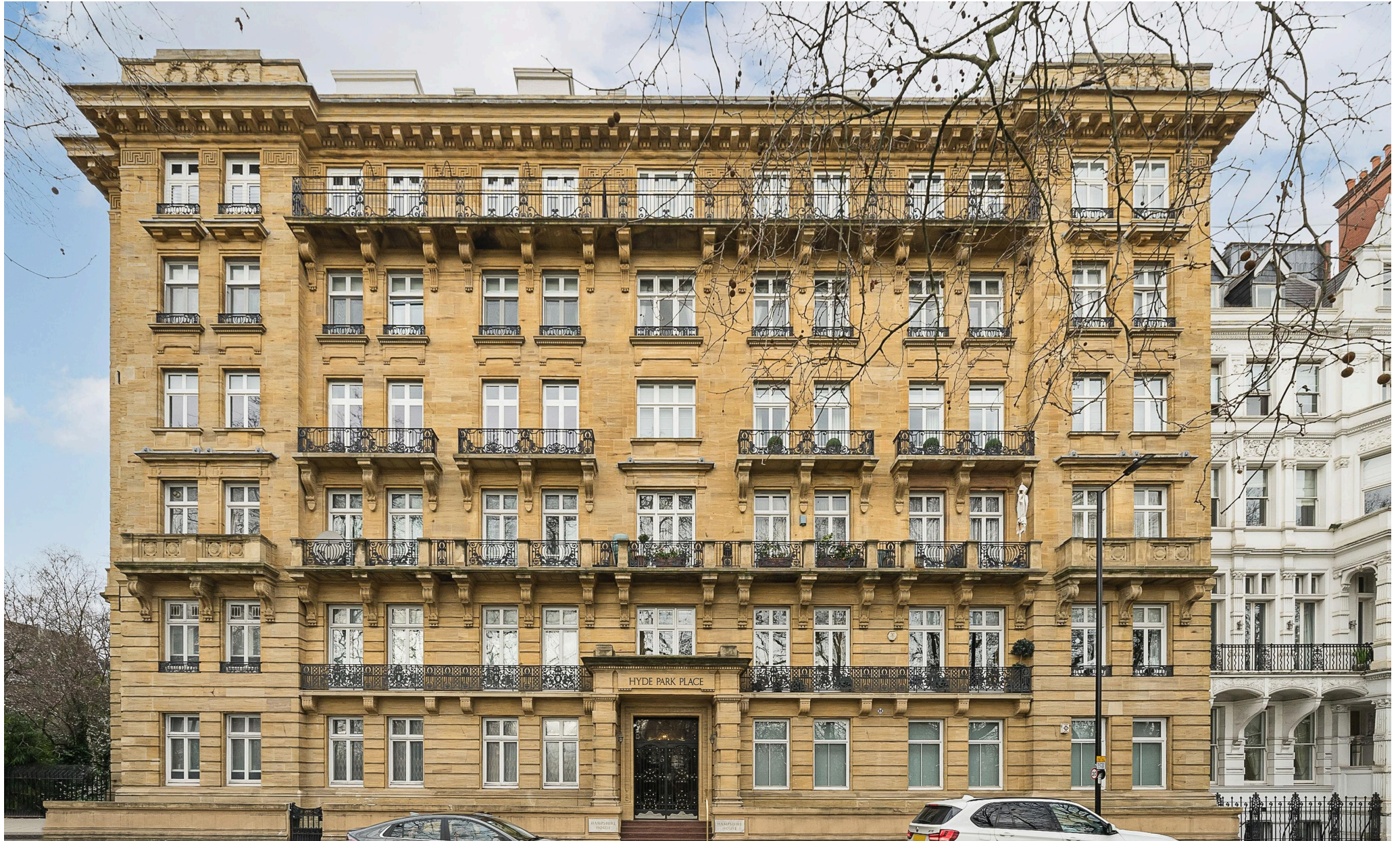
Hampshire House, Hyde Park W2