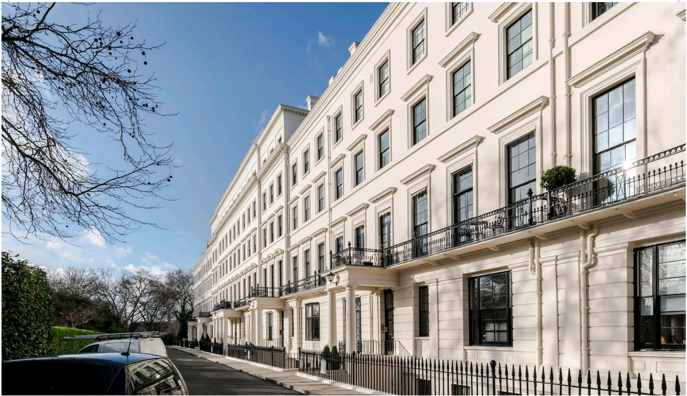
Hyde Park Gardens, Hyde Park W2