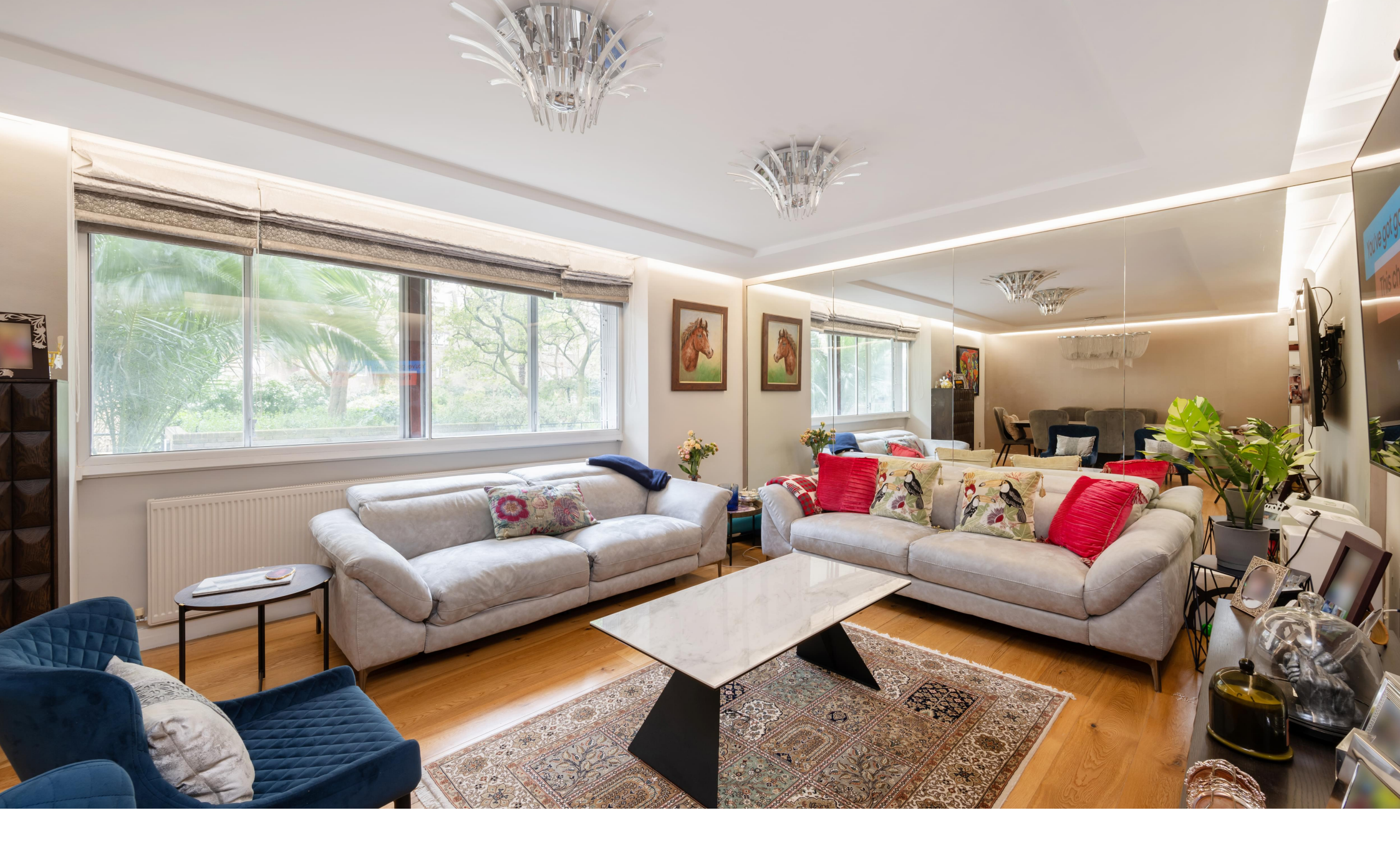
Hyde Park Estate, London W2