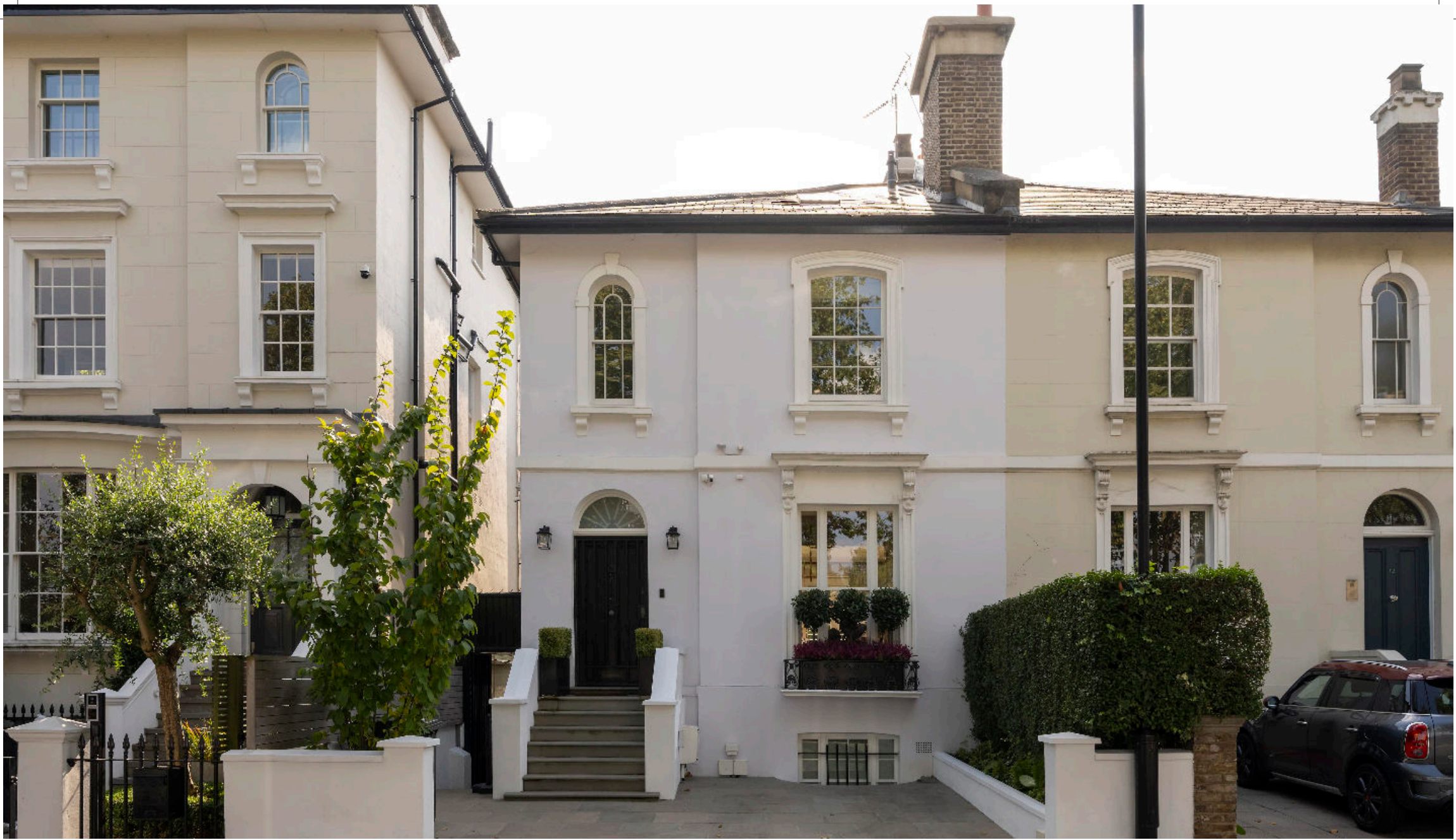
Westbourne Park Villas, Notting Hill W2