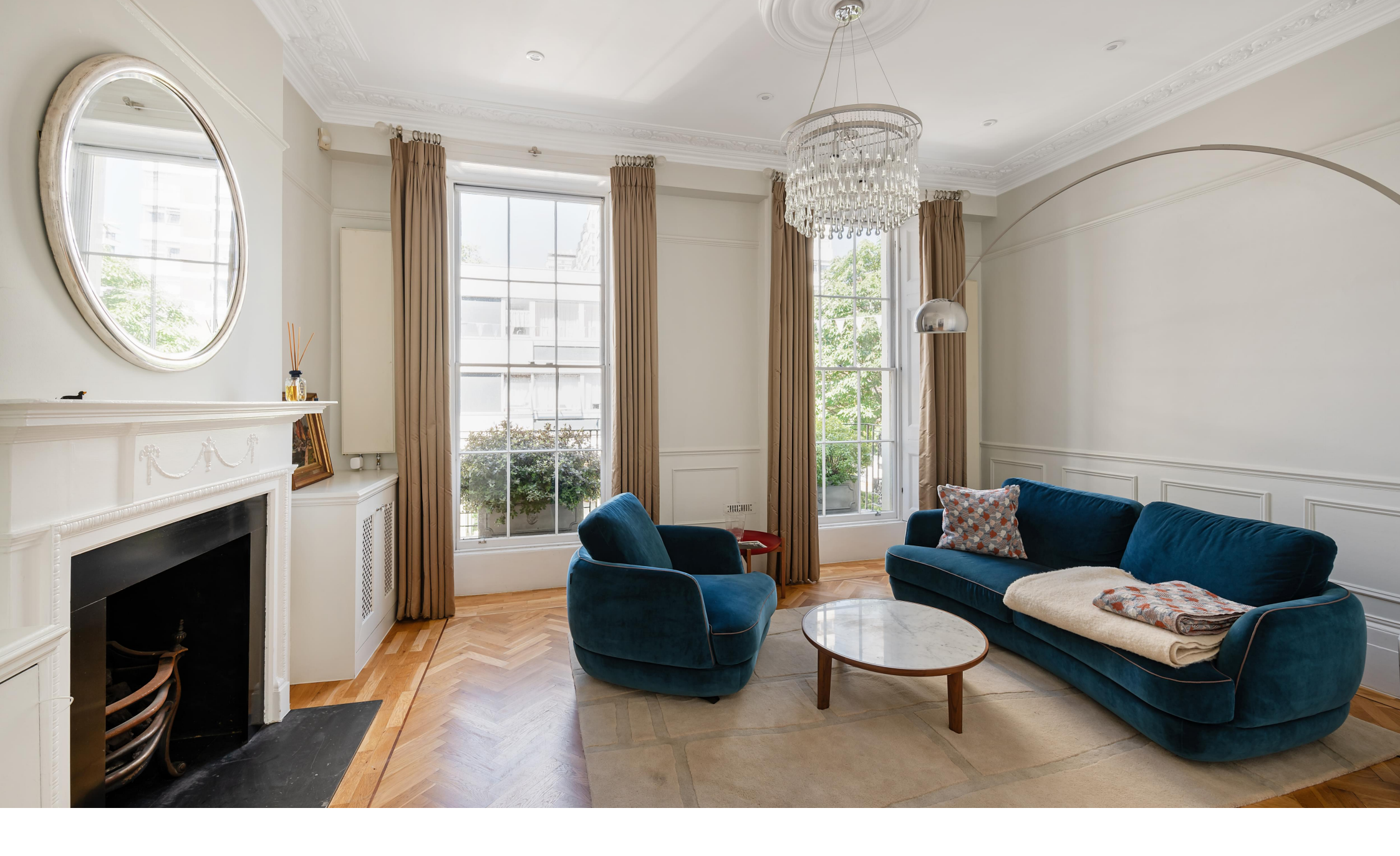
Kendal Street, Hyde Park W2