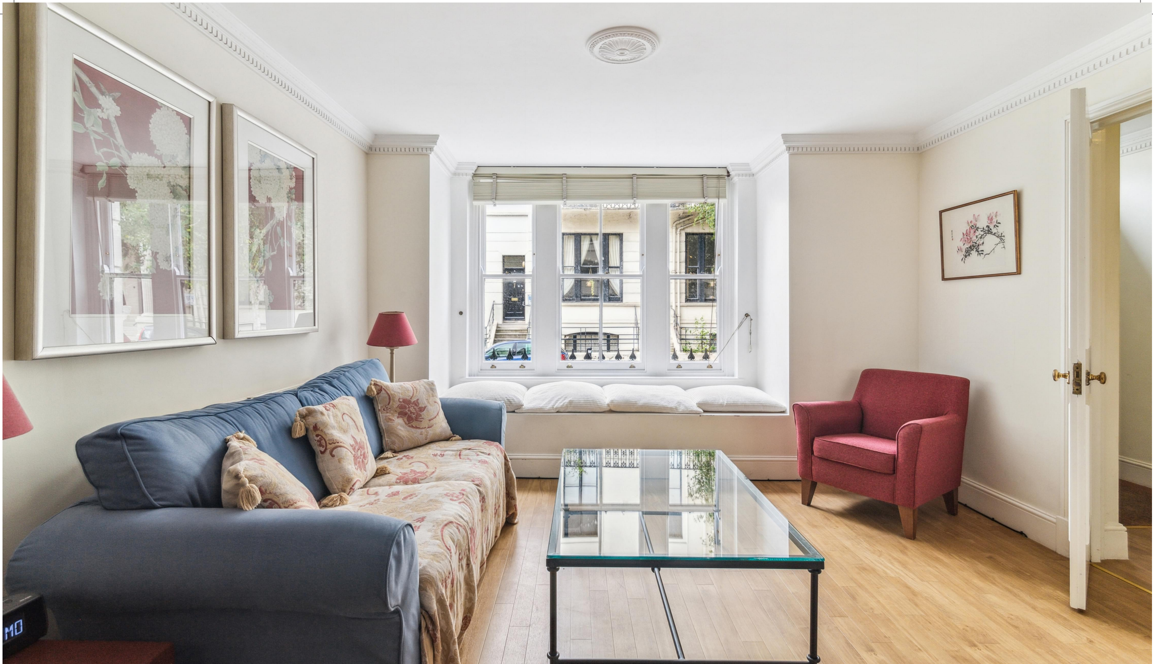
Leonard Court, Westbourne Terrace W2