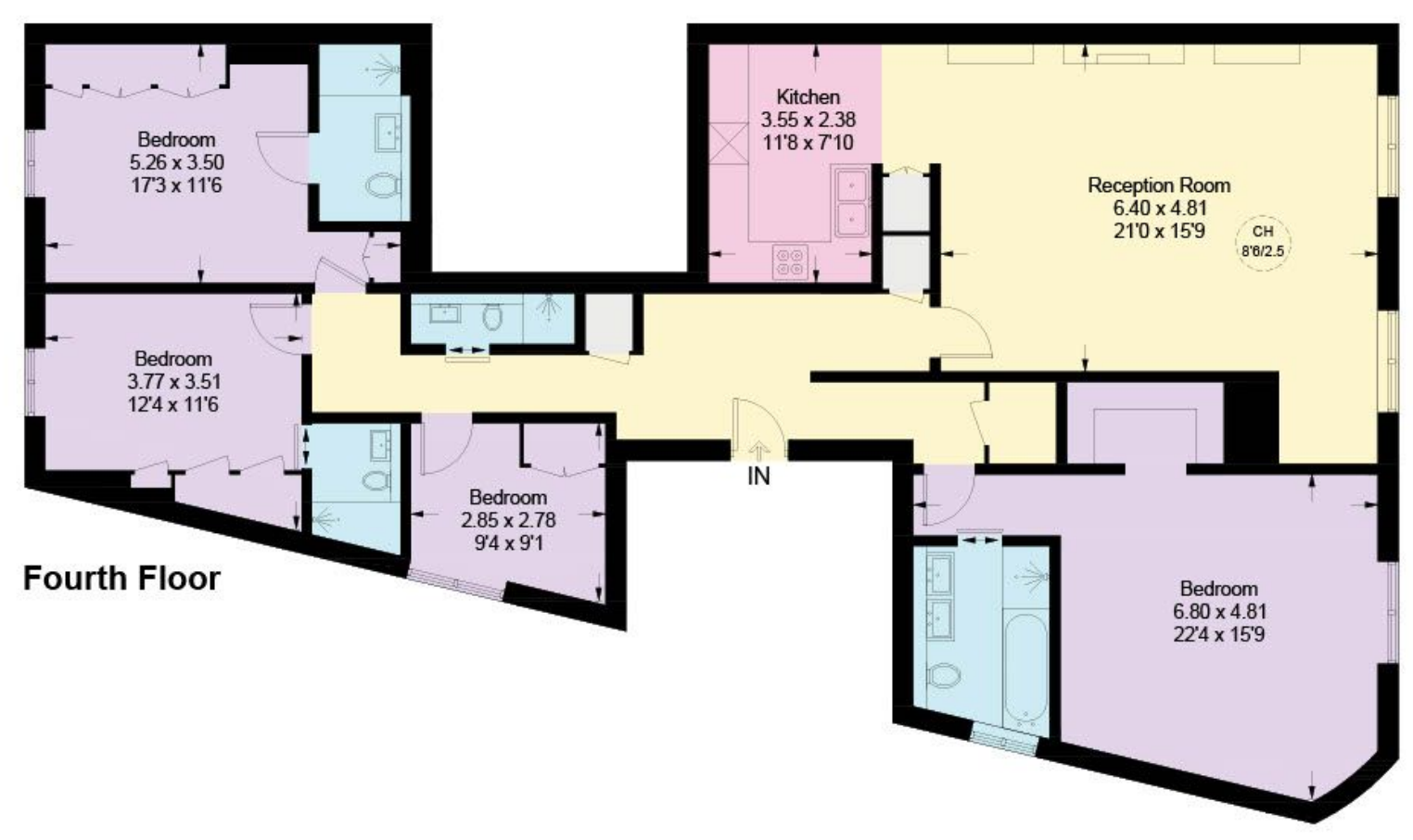
Illustration for identification purposes only, measurements are approximate, not to scale. floorplansUsketch.com @ (ID977543)