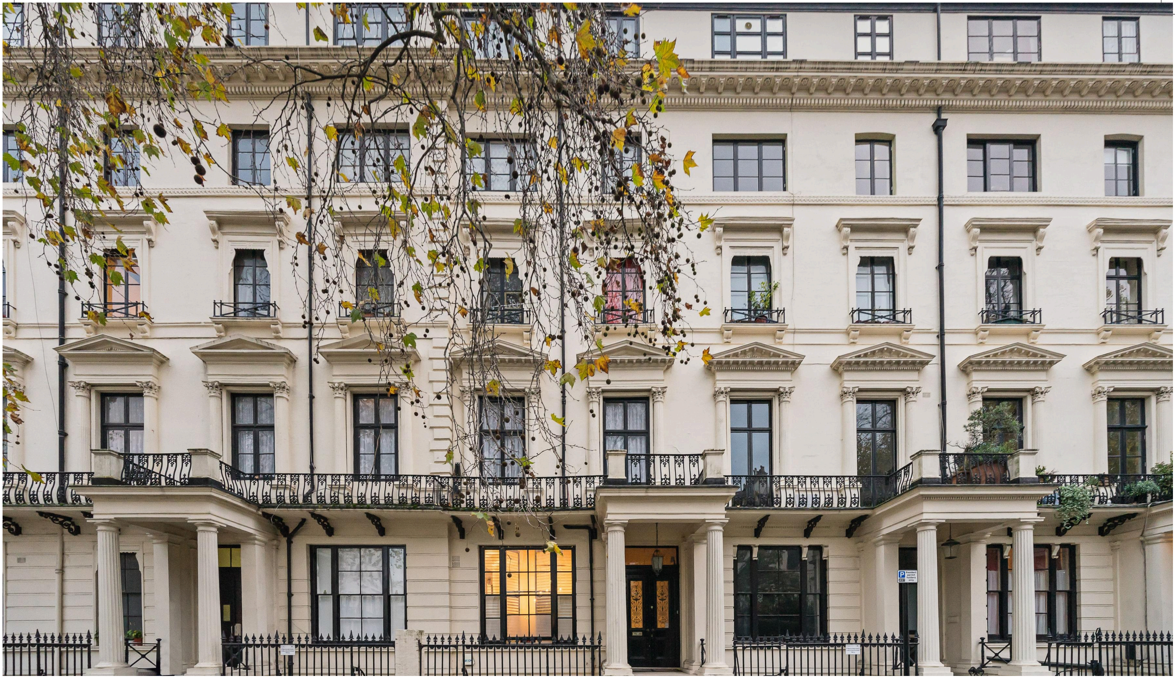
Westbourne Terrace, London W2