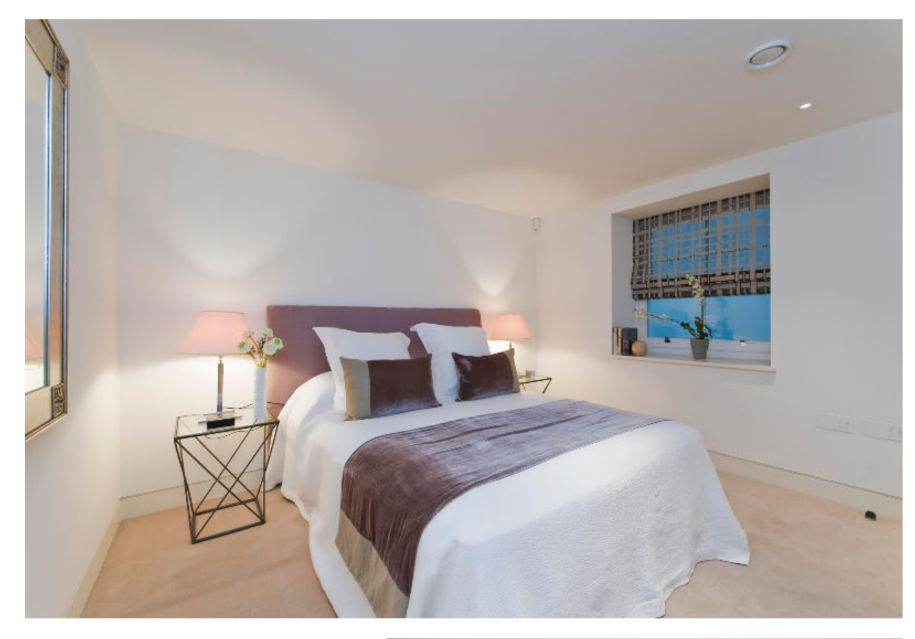
City of Westminster Available furnished Guide price £1,400 per week