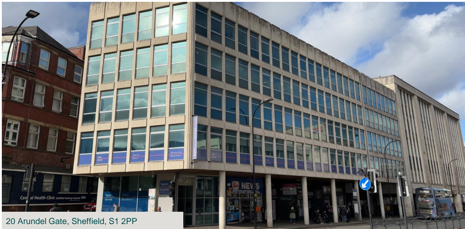
20 Arundel Gate, Sheffield, S1 2PP