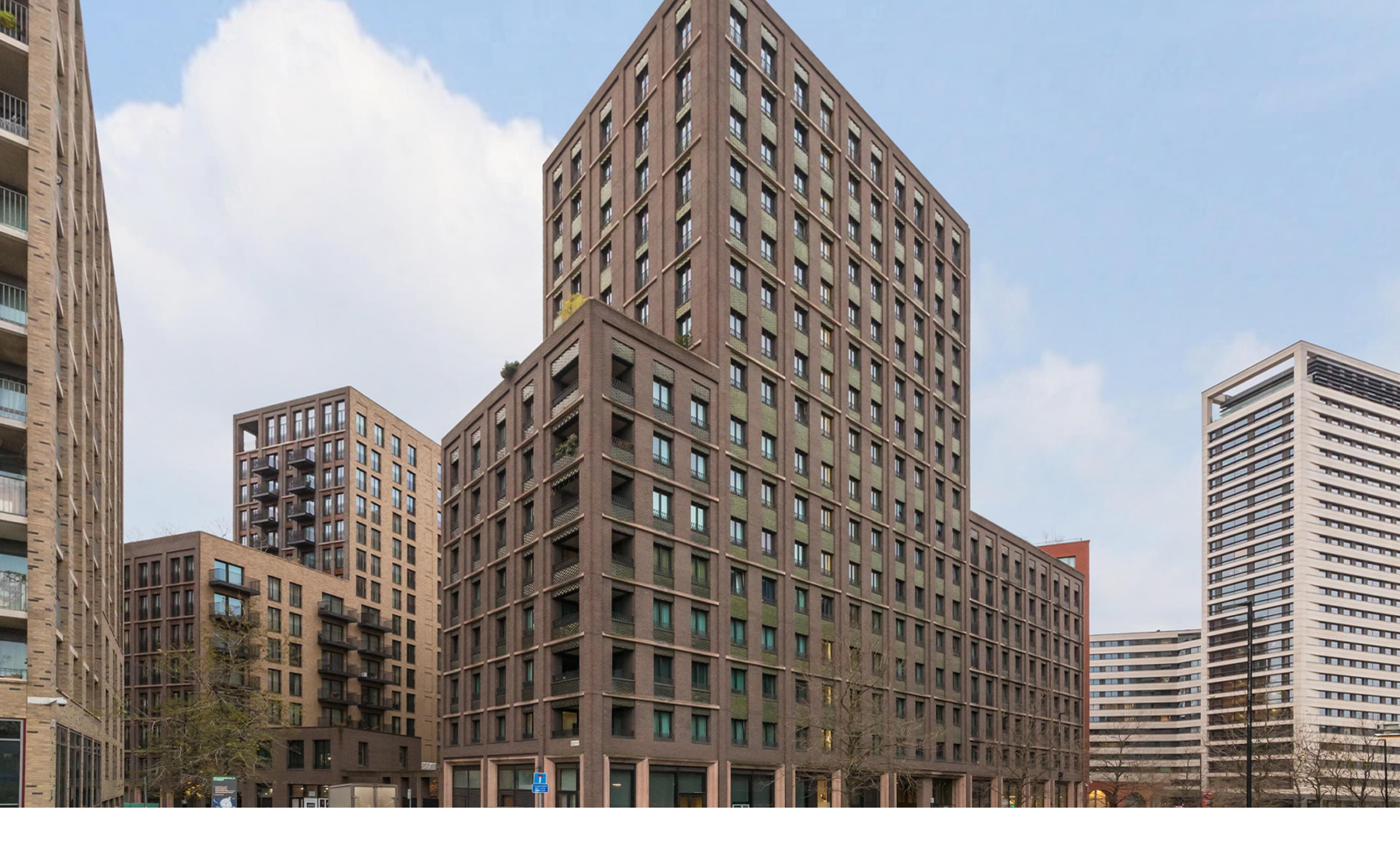
York Way, King's Cross, London NIC