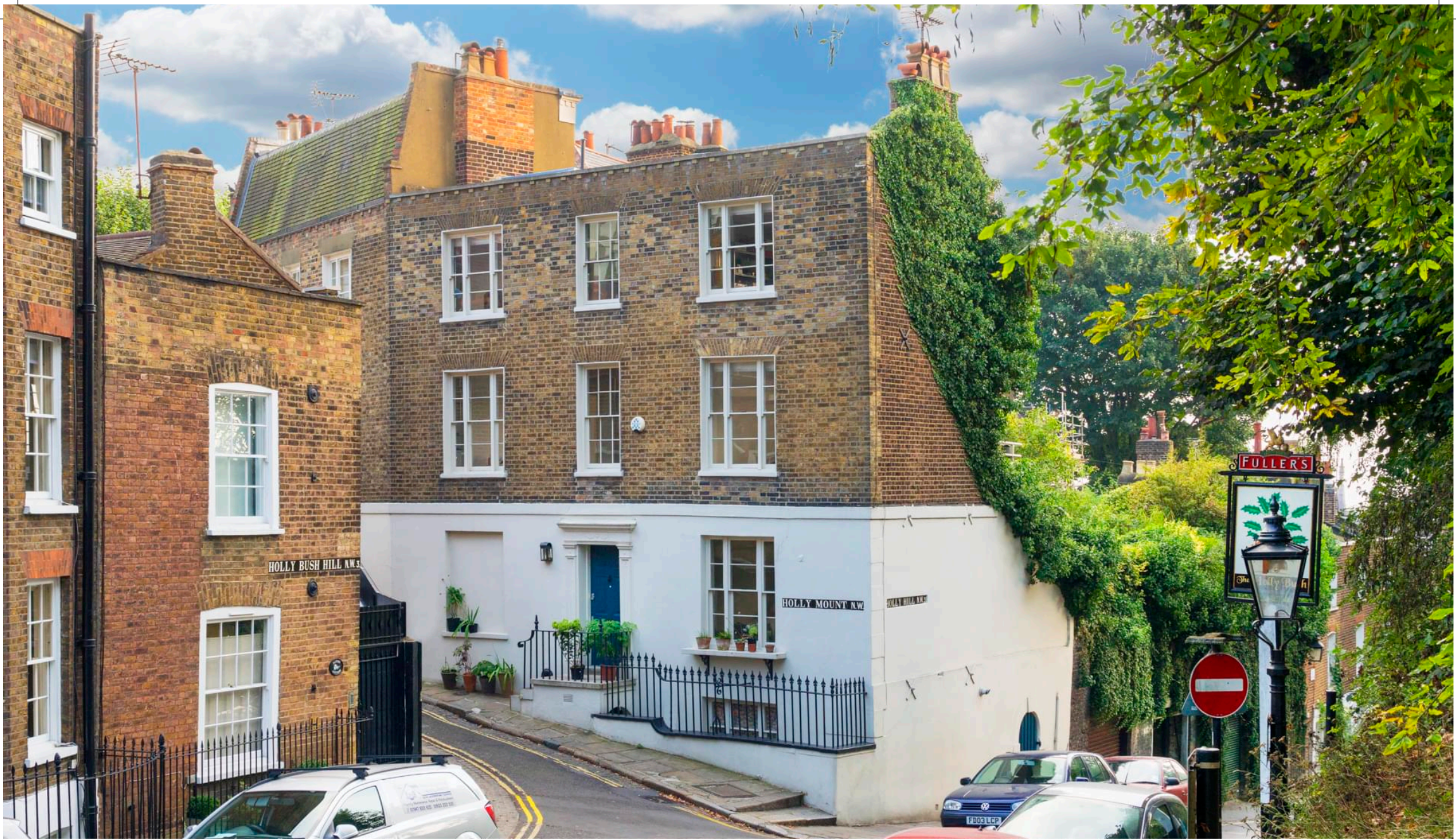
Holly Mount, Hampstead, London NW3