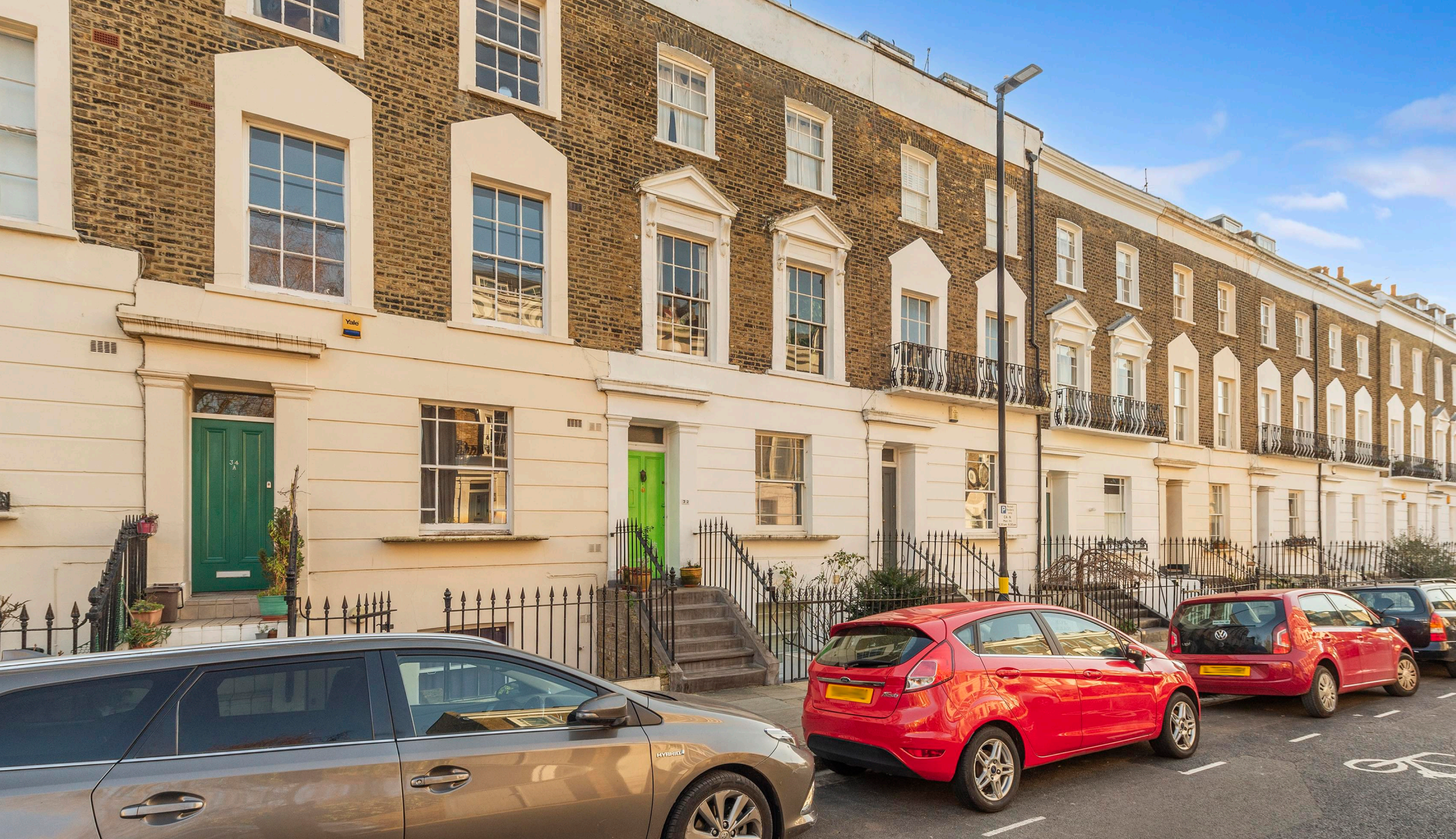
Stratford Villas, Camden, London NW1