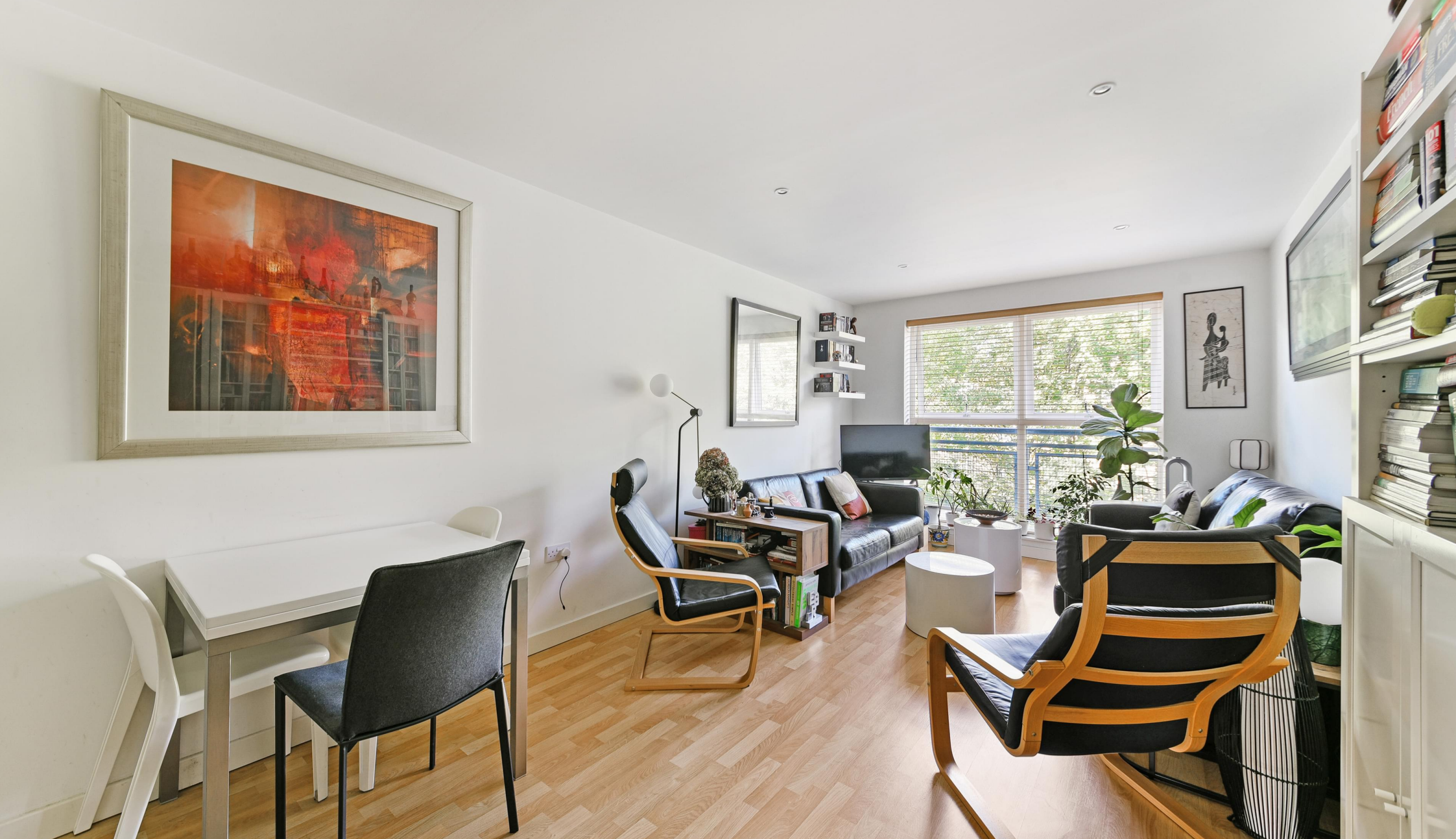
Northpoint House, London NI