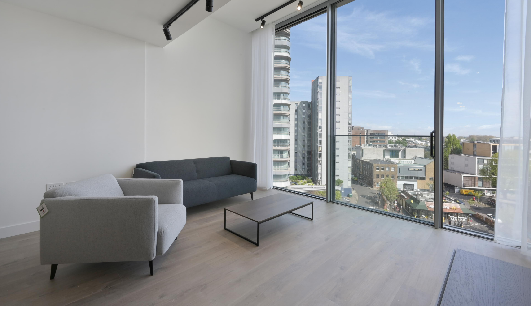
Valencia Tower, London ECIV