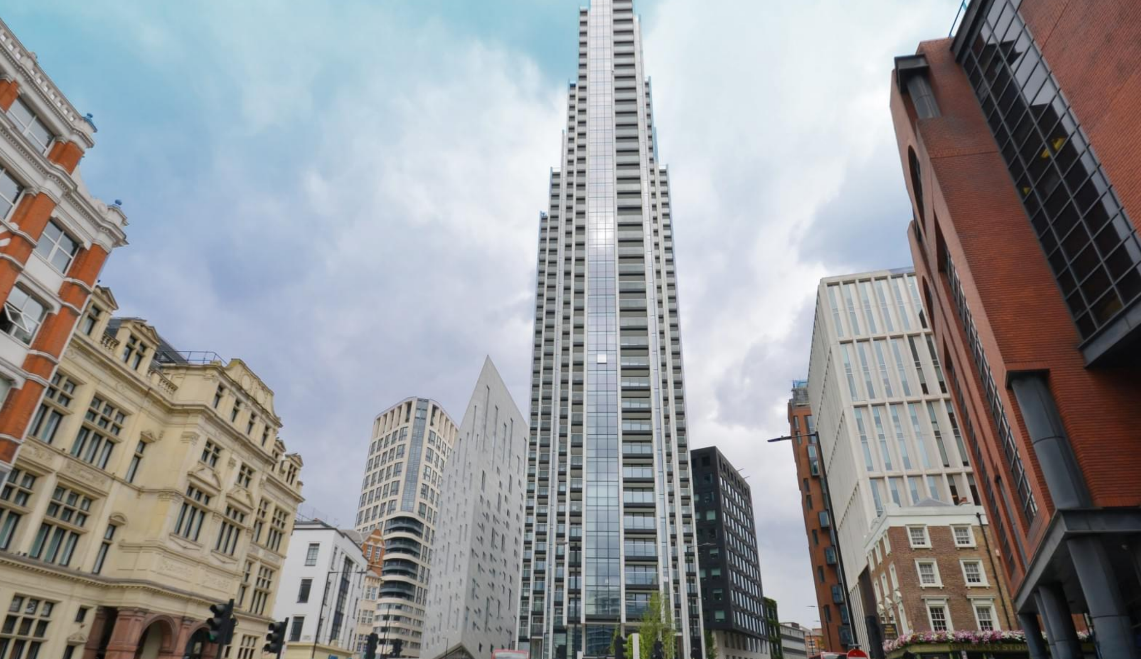
Atlas Tower, London ECIV