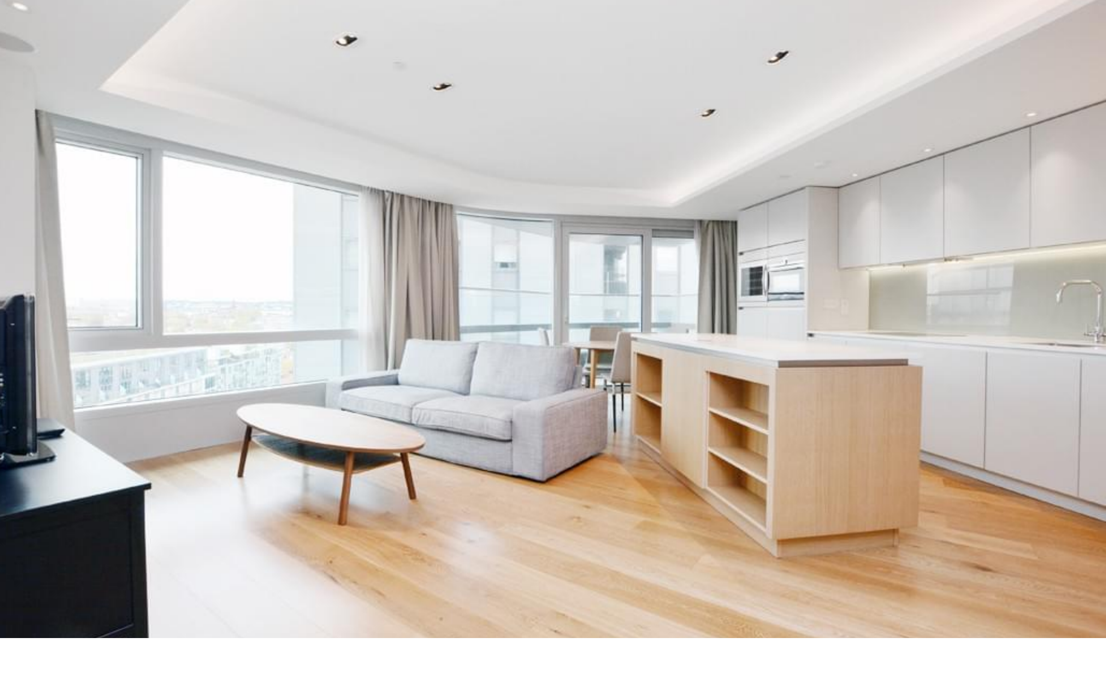
Canaletto Tower, London ECIV