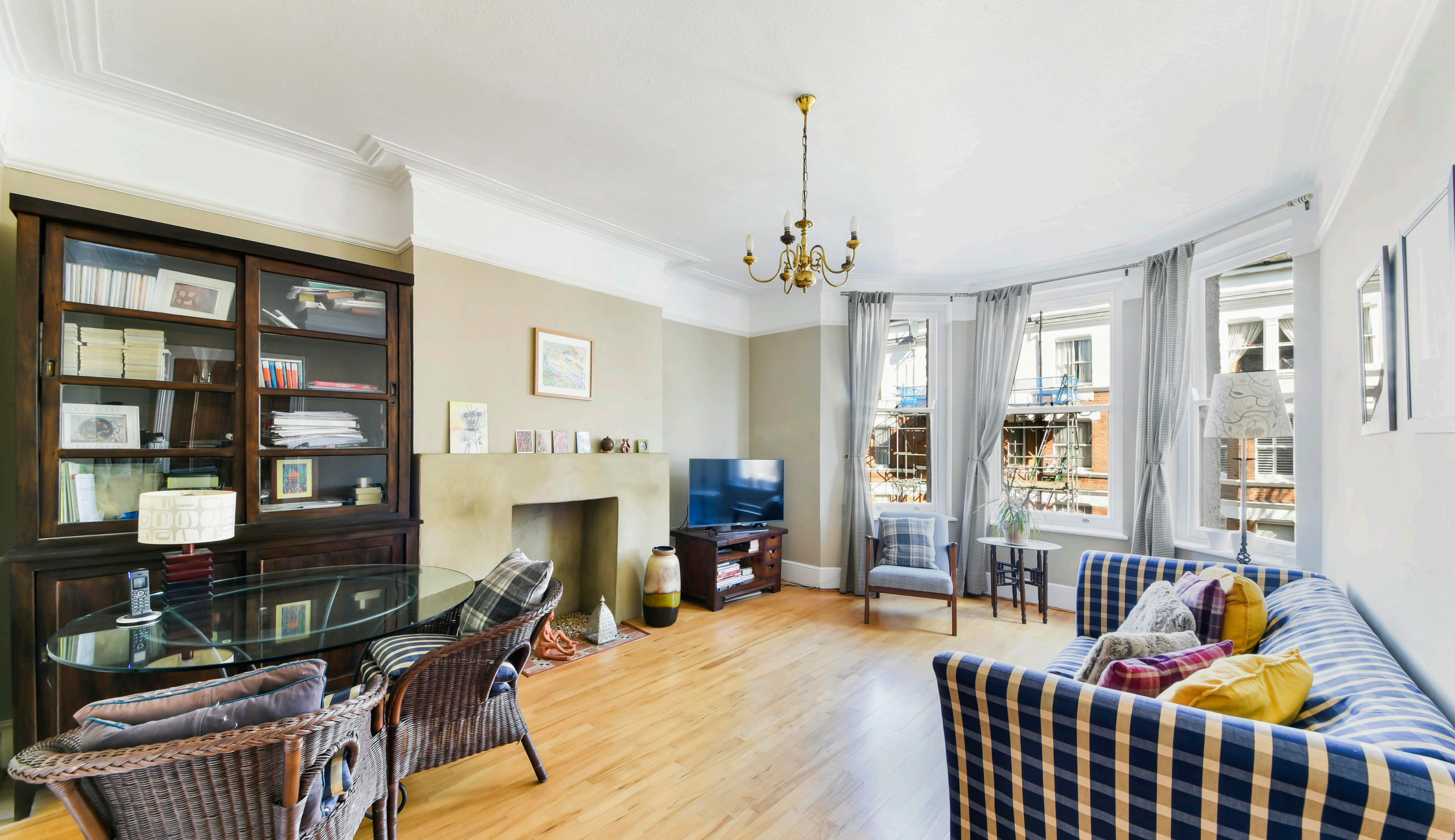
Lorraine Mansions, London N7