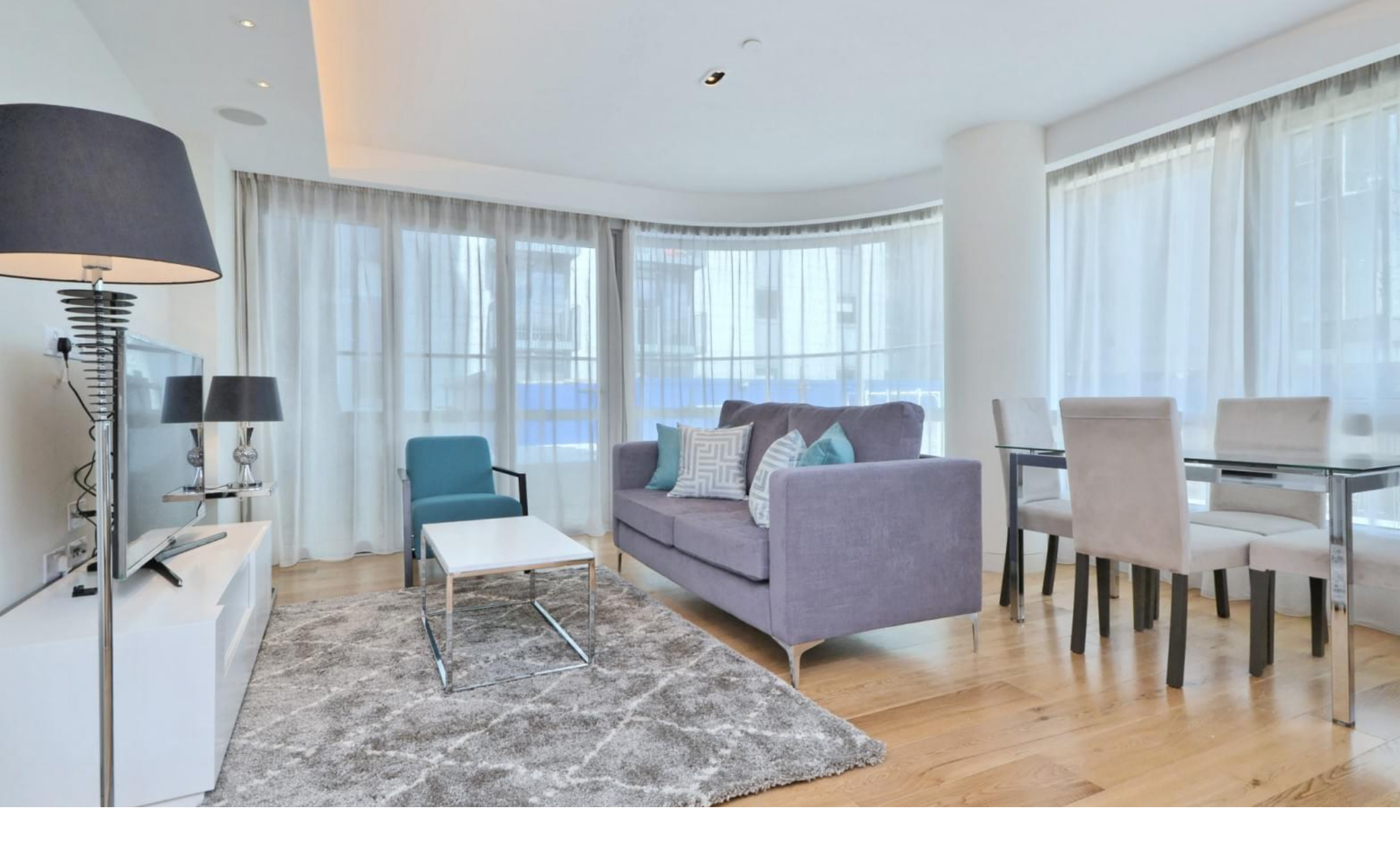
Canaletto Tower, London ECIV