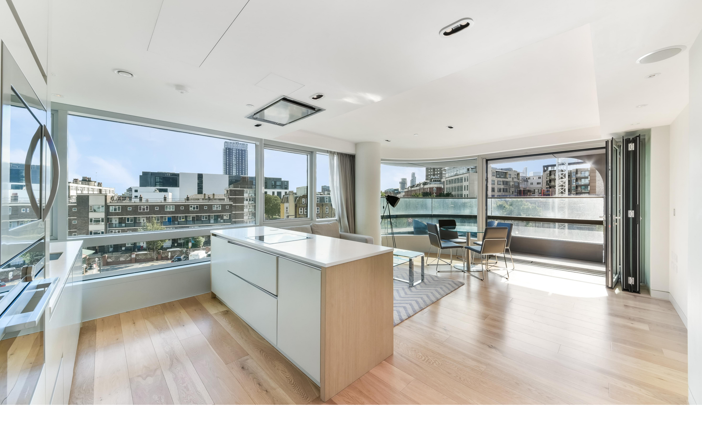
Canaletto Tower, London ECIV