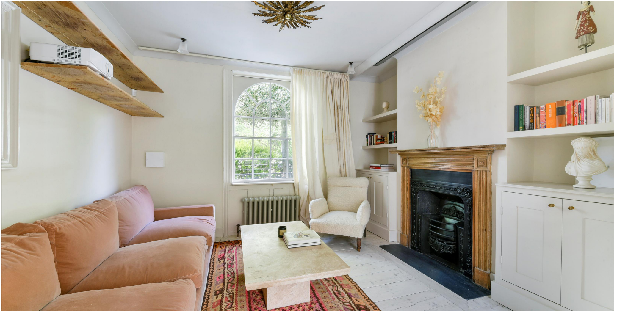
CANONBURY GROVE, London N1