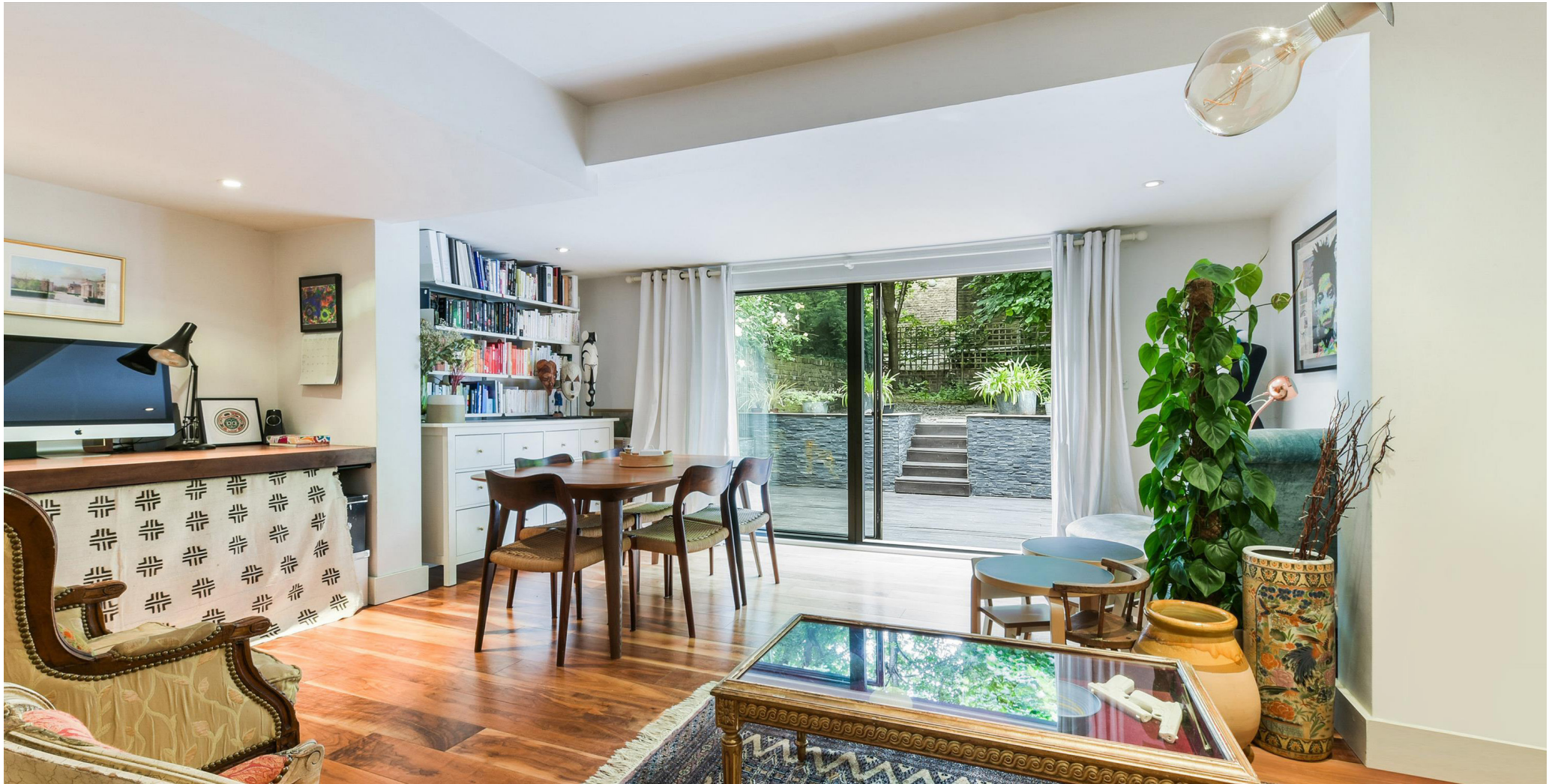
SOUTHGATE ROAD, London N1