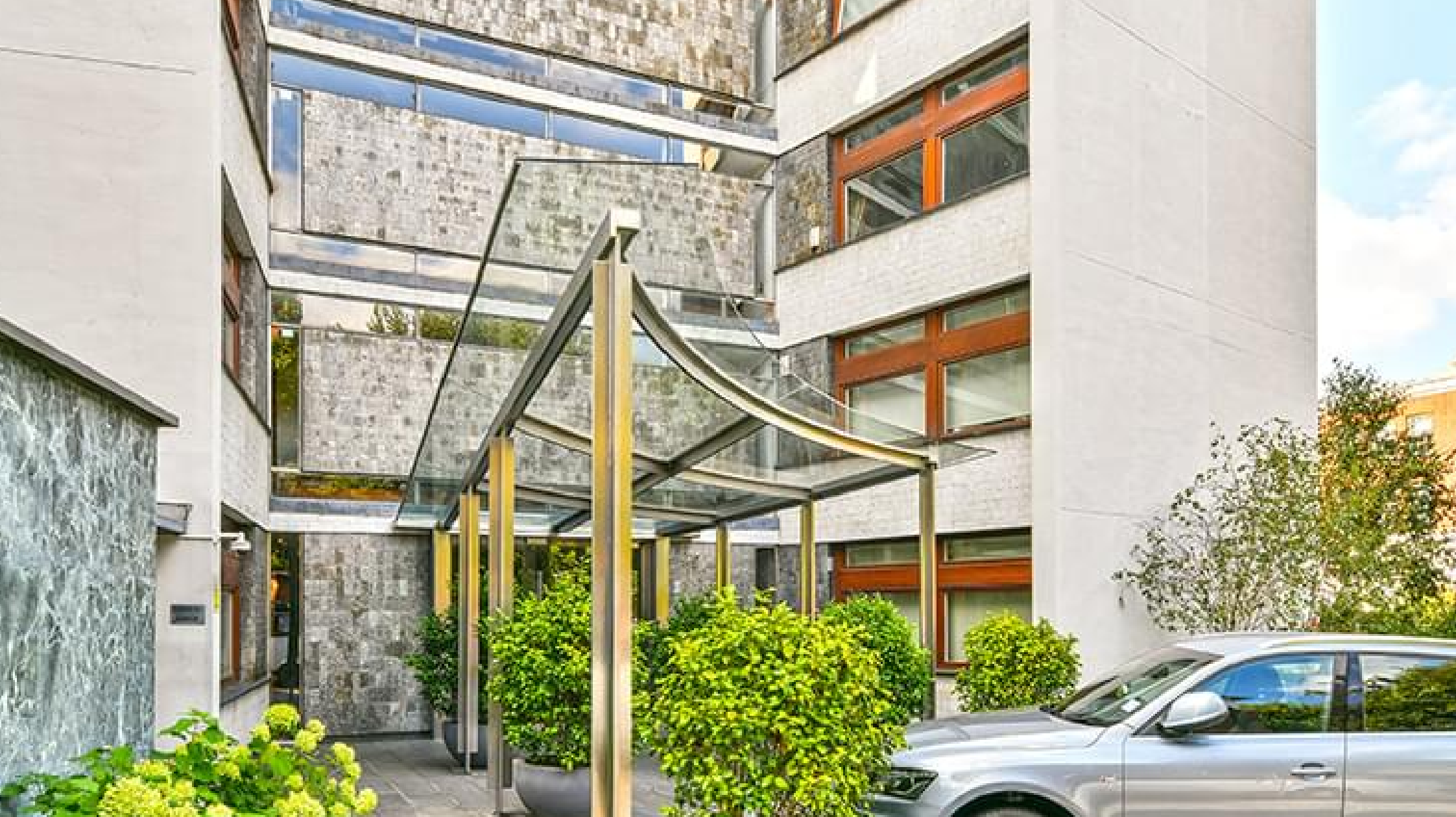
Stavordale Lodge, London W14