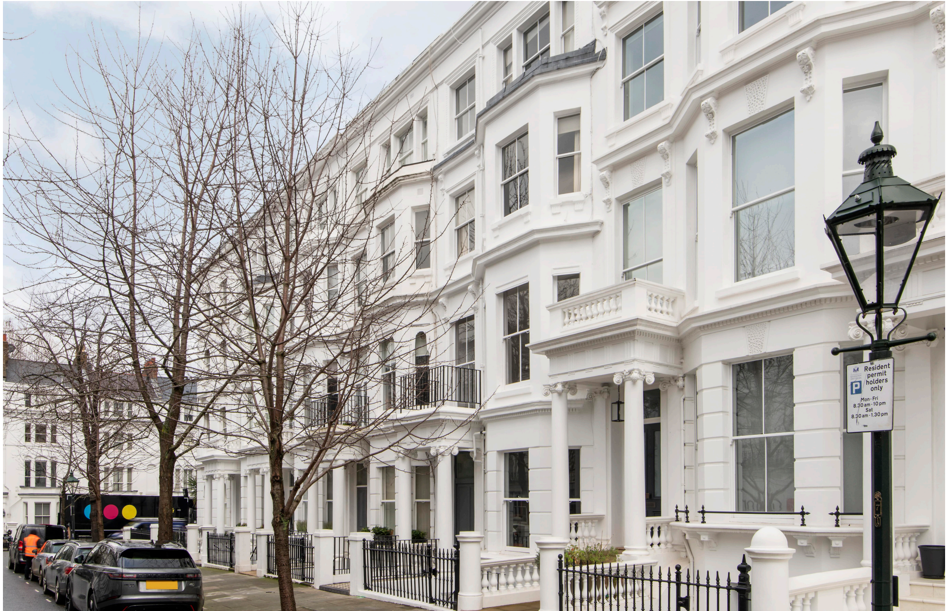
Brunswick Gardens, Kensington W8