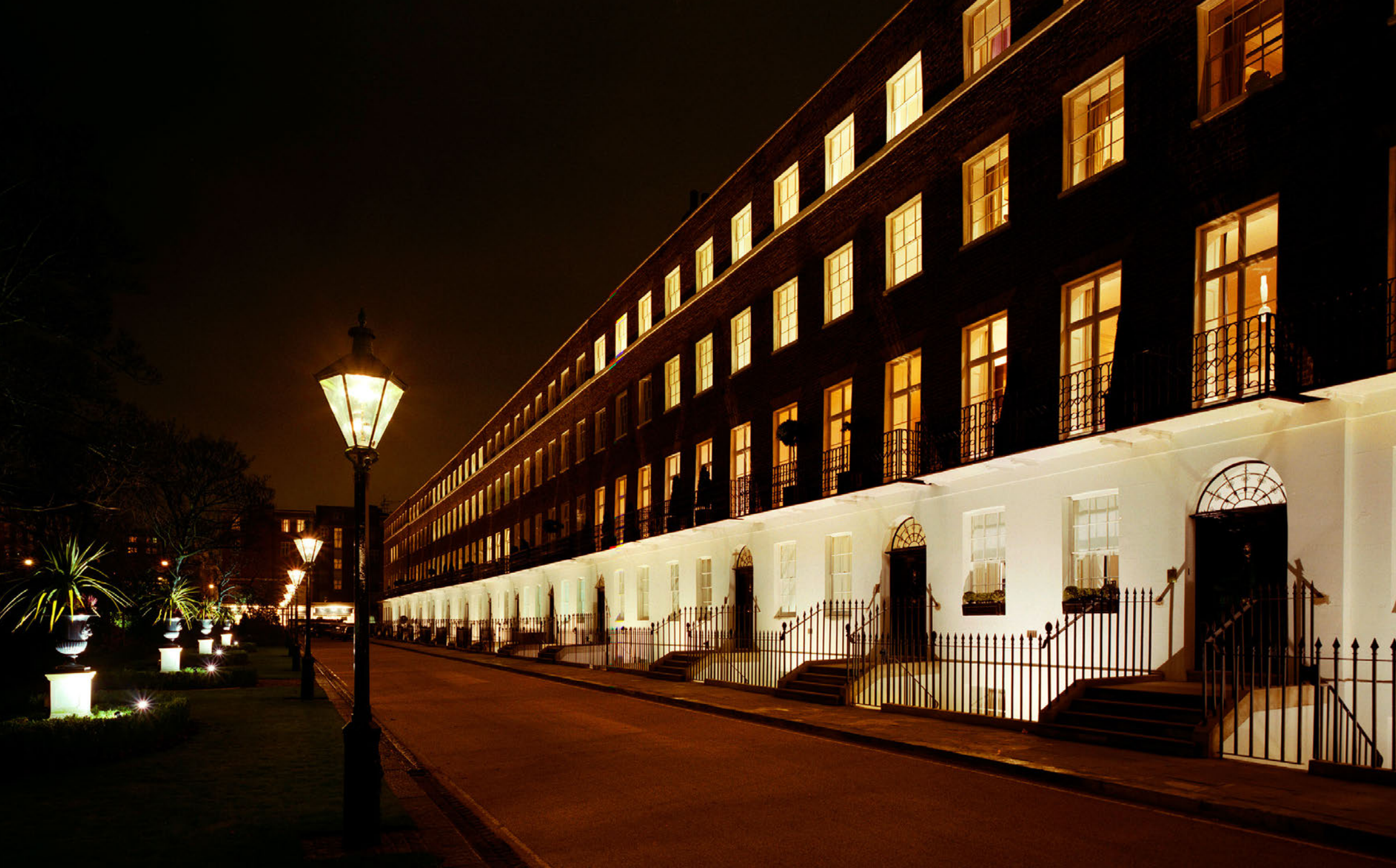
Earls Terrace, Kensington, W8