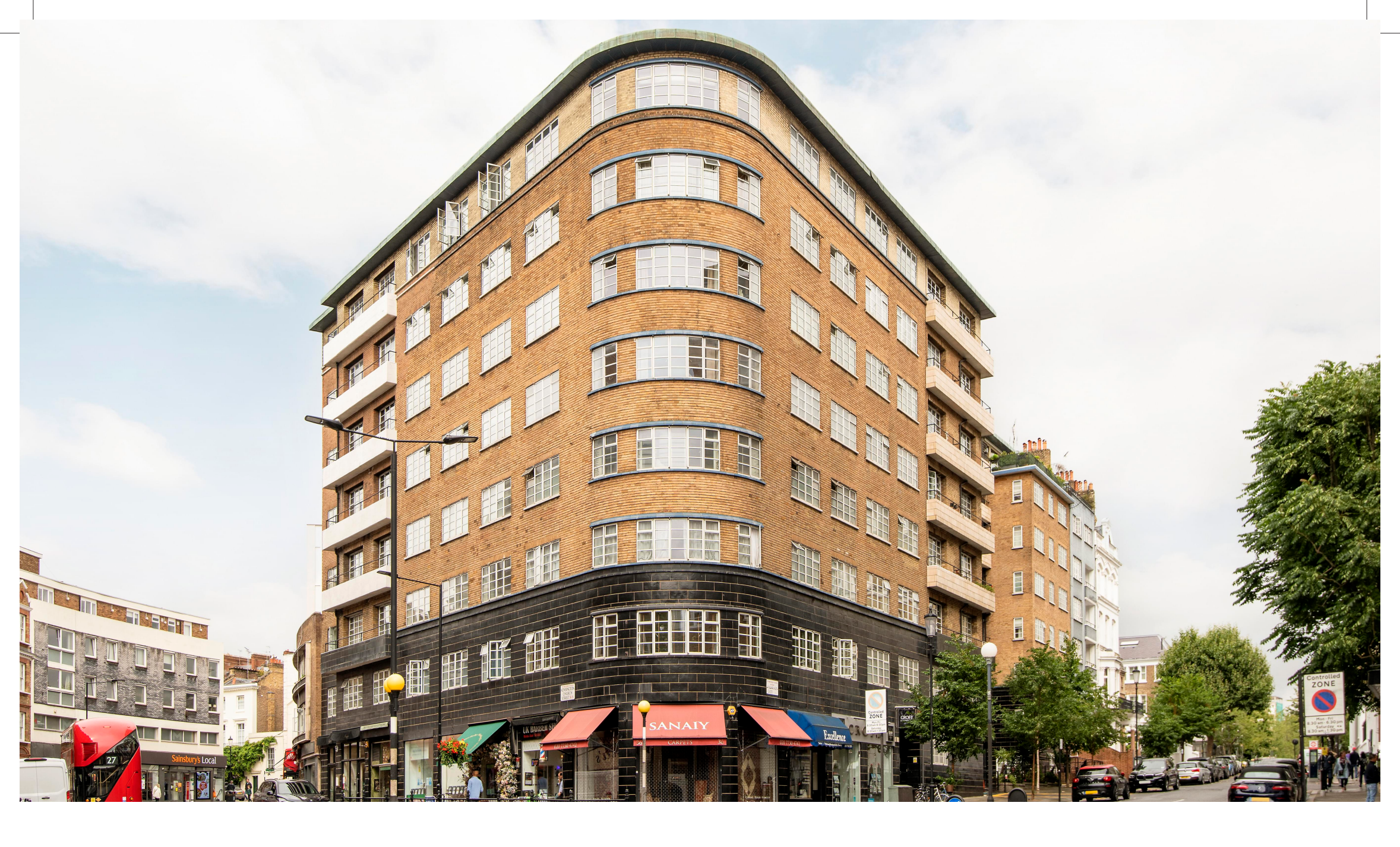
Winchester Court, Kensington, London W8