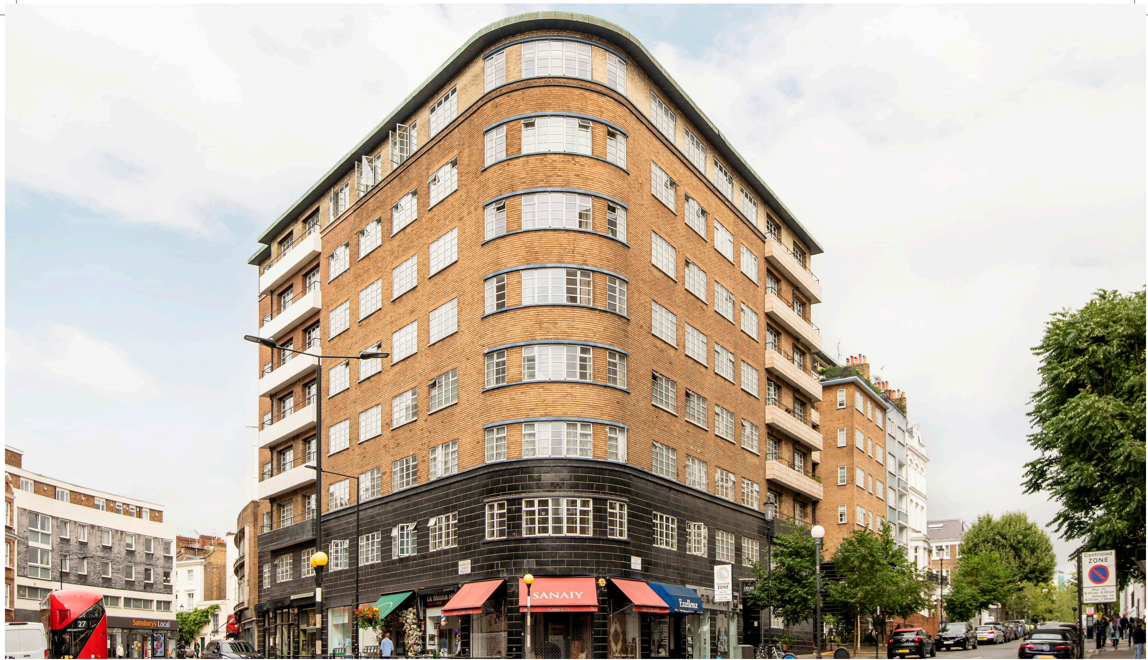
Winchester Court, Kensington, London W8