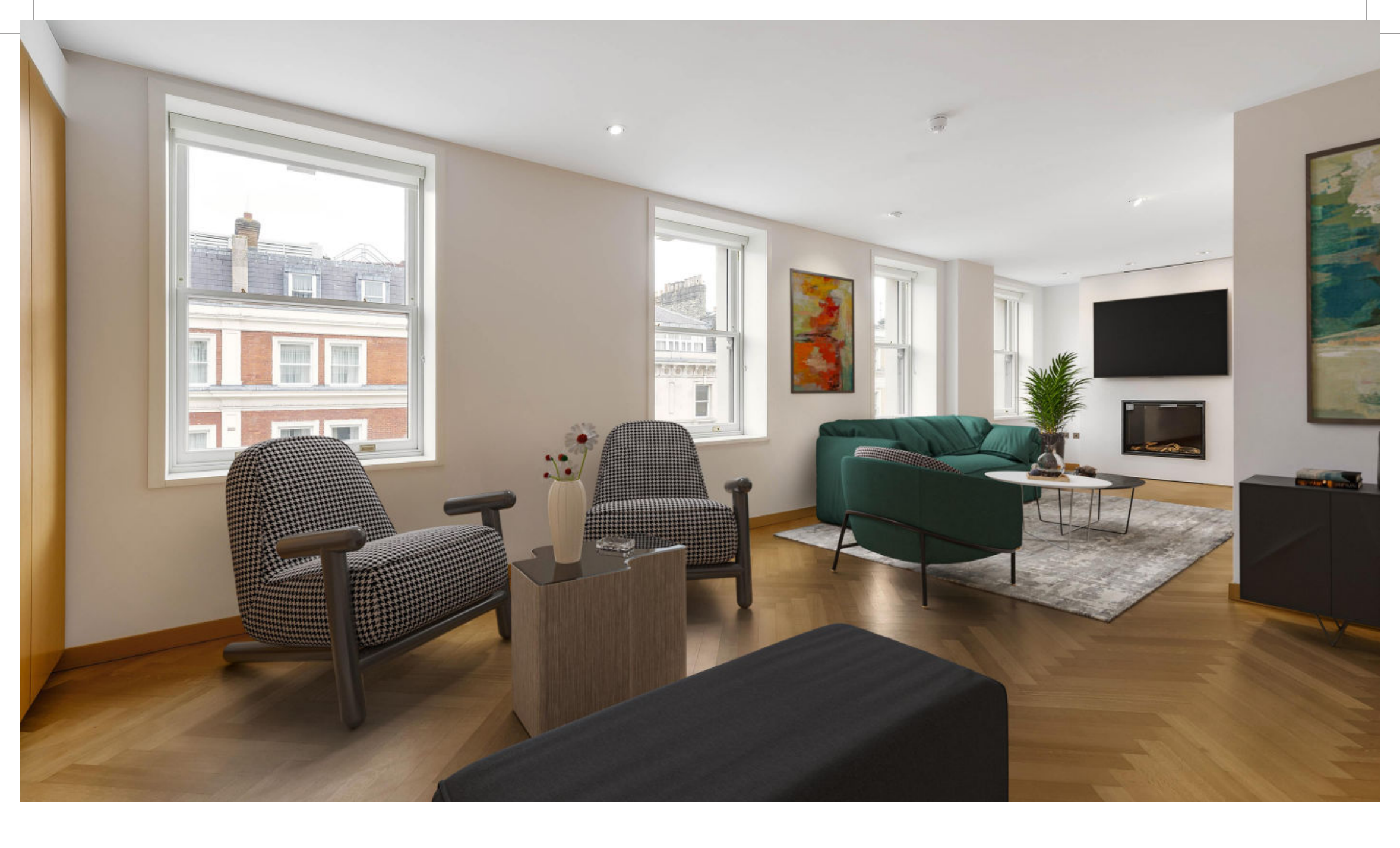
One Kensington Gardens, Kensington W8