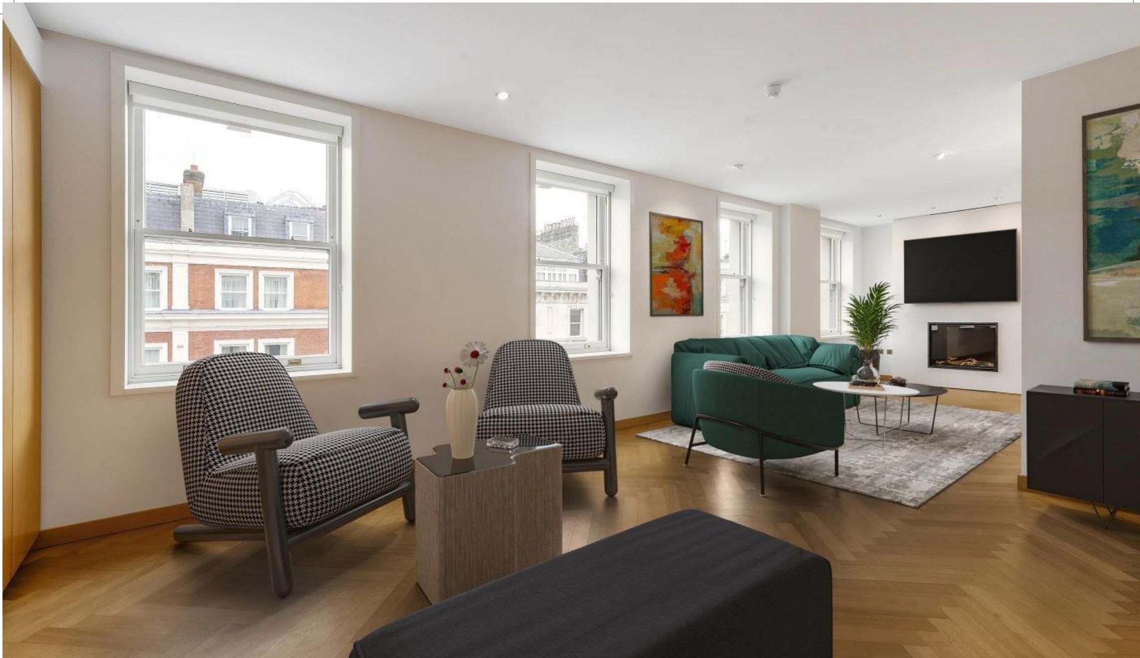
One Kensington Gardens, Kensington W8